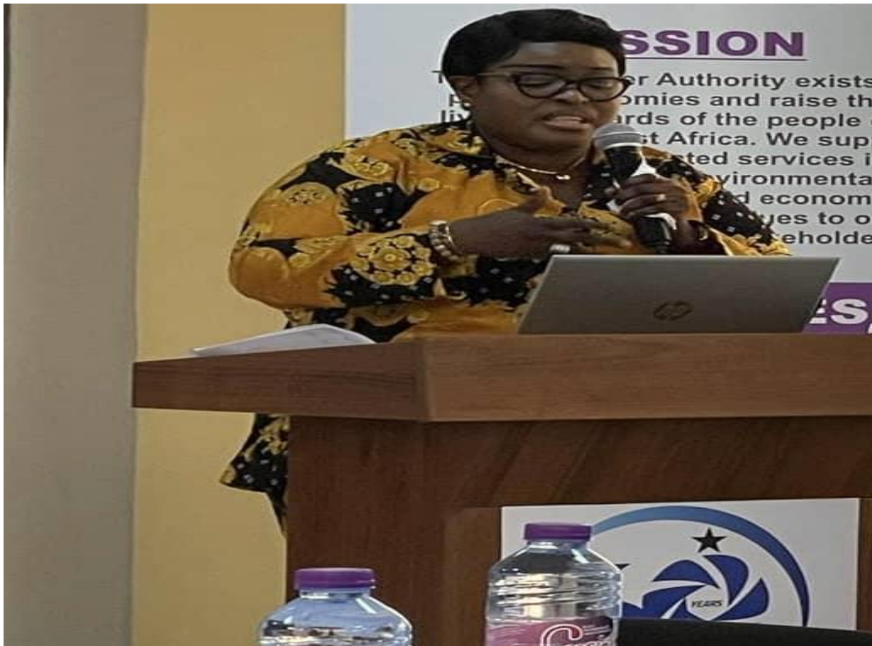
The Director of Admin. & HR making a presentation at an in-house training for VRA management and staff.