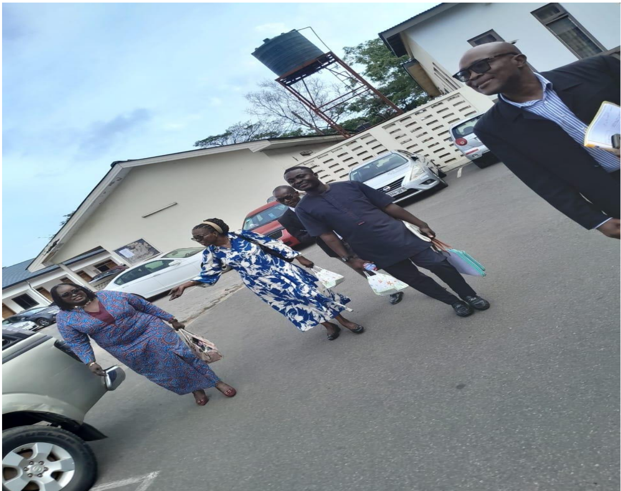
The NLC Management Team at the 2024 Budget Hearing at the MoF