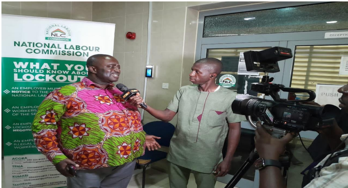
The Executive Secretary of the Commission being interviewed by the media after the hearing session of the threat of strike by the Mortuary Workers' Association of Ghana (MOWAG)