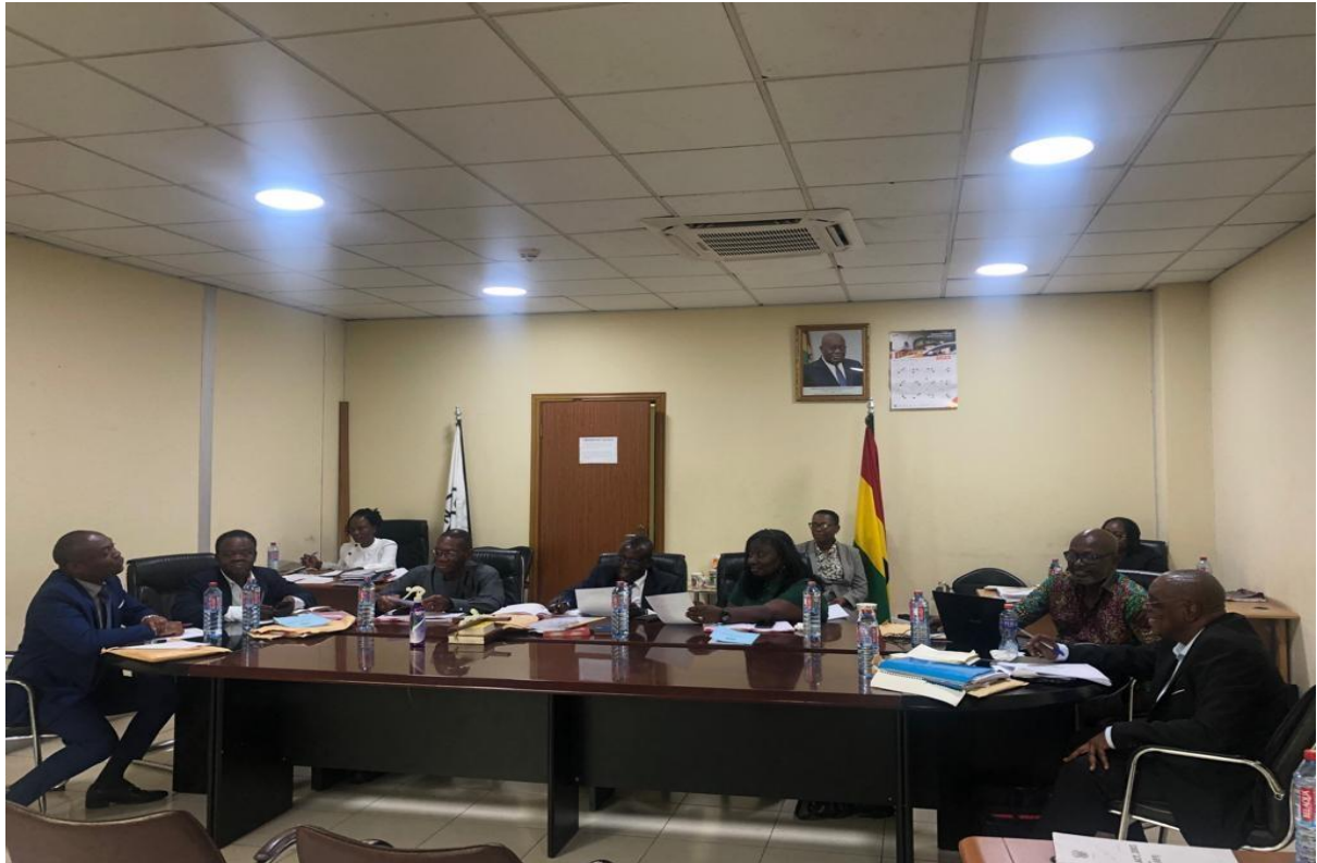
The Members of the Commission at a hearing session