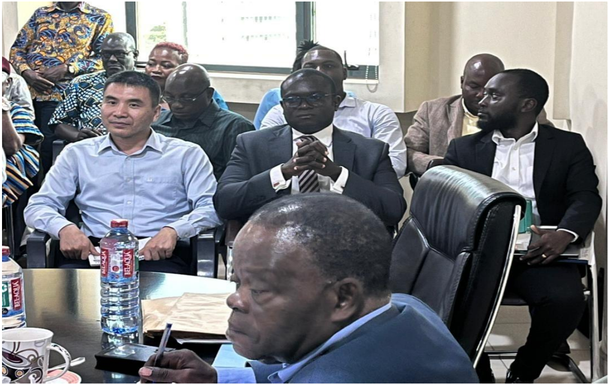
Management and Lawyers for Asogli Power Plant at the hearing session of the Asogli dispute