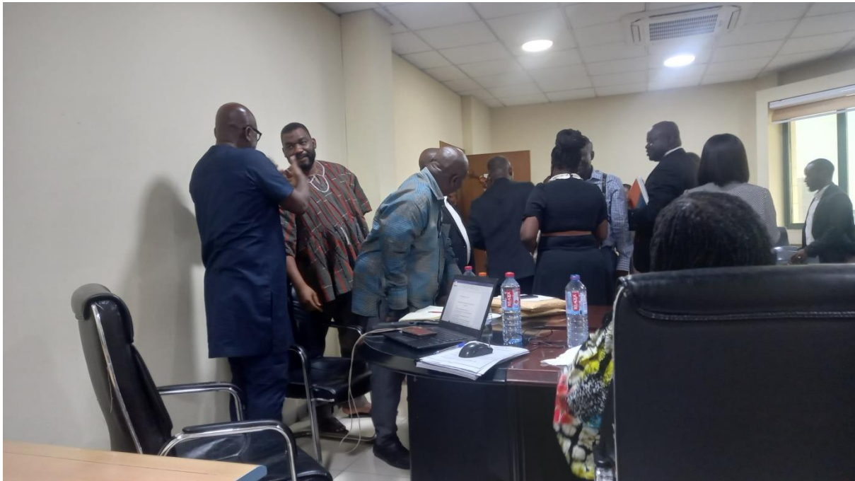
The picture above shows the Leadership of the Trades Union Congress (TUC) interacting with Members of the Commission after a hearing session of a strike dispute.