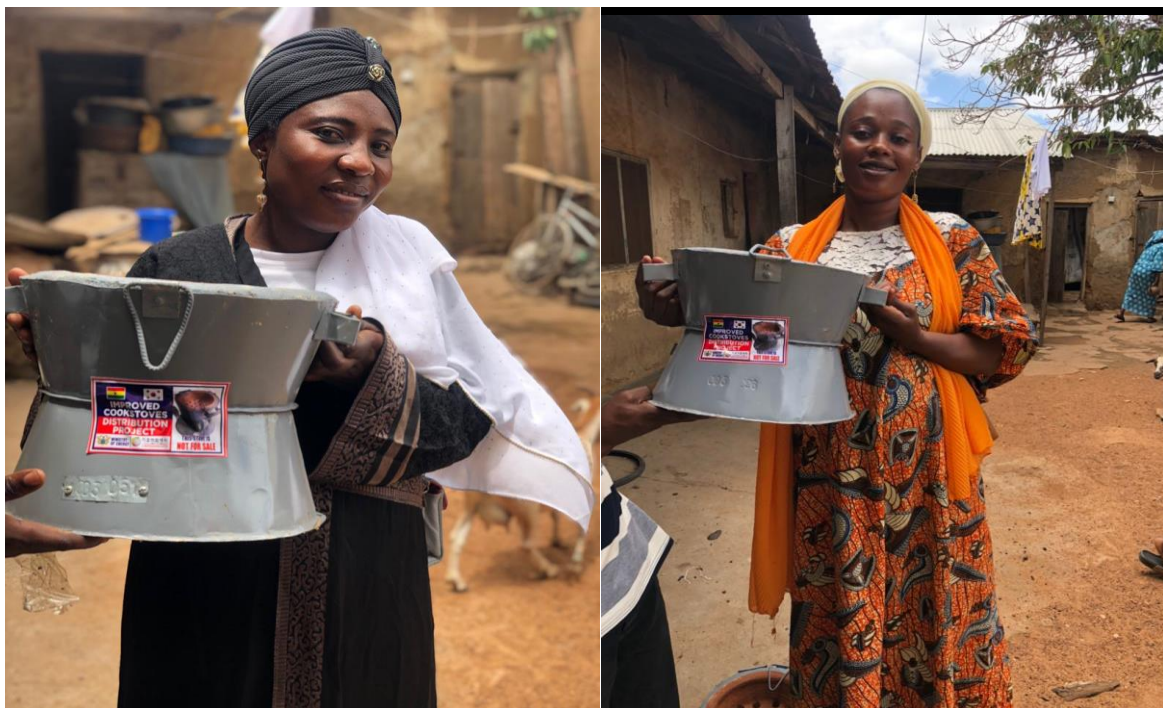
Beneficiaries of Improved Charcoal Cook Stoves Distribution

A total of 97,253 improved charcoal cookstoves have been locally manufactured and distributed, bringing the total number of cookstoves distributed since the inception of the project to 438,521. Additional 61,379 improved cookstoves, locally manufactured, are expected to be distributed by end of the year. The project aims to increase access to clean cooking solutions. The Improved Charcoal Cook Stoves distribution programme will address the exposure of women and children to carbon monoxide emissions from the use of wood fuel for cooking as well as reduce deforestation. The Ministry has established a Memorandum of Understanding with C-Quest a non for -profit organization and the Kingdom of Saudi Government to support our clean cooking agenda.