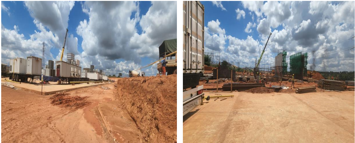
RELOCATION OF AMERI PLANT - WORKS ONGOING AT ANWOMASO

Six (6) Units of the Ameri Plant have been successfully relocated from Aboadze to Anwomaso in Kumasi. Installation works of the units has commenced and awaiting commissioning on natural gas by end of 2023.