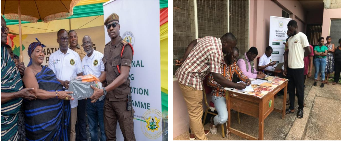
DISTRIBUTION OF LPG COOKSTOVES AND ITS RELATED ACCESSORIES TO BENEFICIARIES

An additional four thousand (4,000) households have benefitted from the distribution of LPG cookstoves and related accessories, resulting in a cumulative total of twenty thousand (20,000) beneficiaries since the launch of the Programme in September 2022. It is expected that an additional two thousand (2,000) households will benefit from the programme before the end of the year.