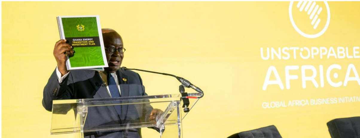
H.E the President launching the NET and Investment Plan at the 78th UN General Assembly

The Ghana Energy Transition and Investment Plan (ETIP) focuses on charting a sustainable pathway to transitioning from fossil fuel-based energy to clean energy to achieve our Net Zero carbon targets. The ETIP was launched by His Excellency the President of the Republic of Ghana at the 78th UN General Assembly. An Inter-ministerial committee has been tasked to facilitate the implementation of the plan.