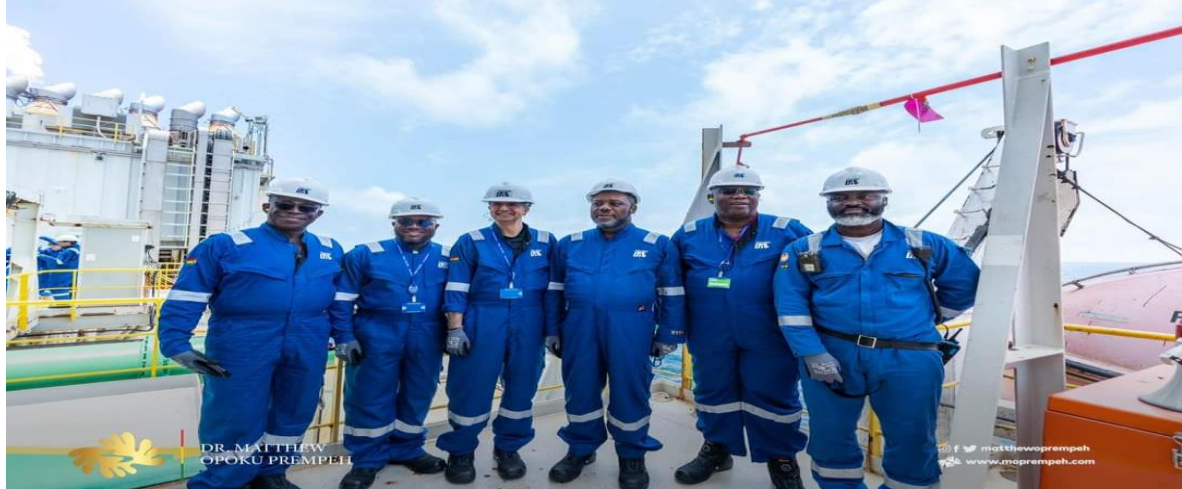
COMMISSIONING OF THE JUBILEE SOUTH EAST PROJECT

Under the Saltpond Field Decommissioning, all six (6) wells earmarked for decommissioning have been plugged and abandoned. The Mr. Louie Platform is about 70% dismantled.