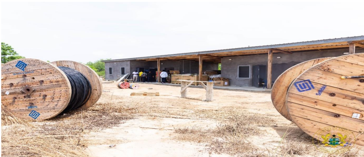
Alorkpem Power House

Equipment and materials for the Ada mini grids project (located at Azizakpe, Aflive, and Alorkpem) and the rehabilitation of the 5 pilot Mini grids (located at Peditorkope, Aglakope, Atigagome, Wayokope and Kudorkope) have been delivered to the project sites. Additional materials are being procured to complete the installation. three (3) mini-grid for island communities in the Ada East District were initiated and currently at least at 80% state of completion.