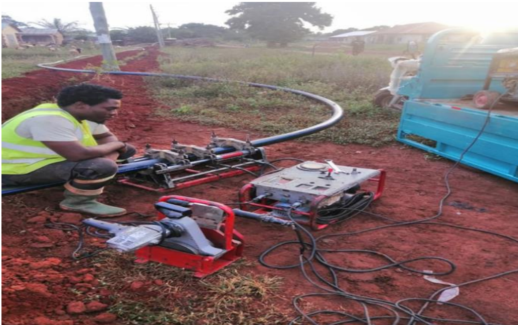
Butt welding ongoing