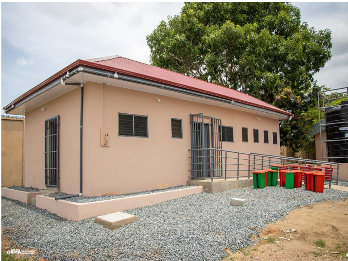
GAMA Institutional Toilet facility

In Greater Accra, 13,983 household toilet facilities have been provided to date exceeding the 12,000 target and benefiting over 112,000 people.