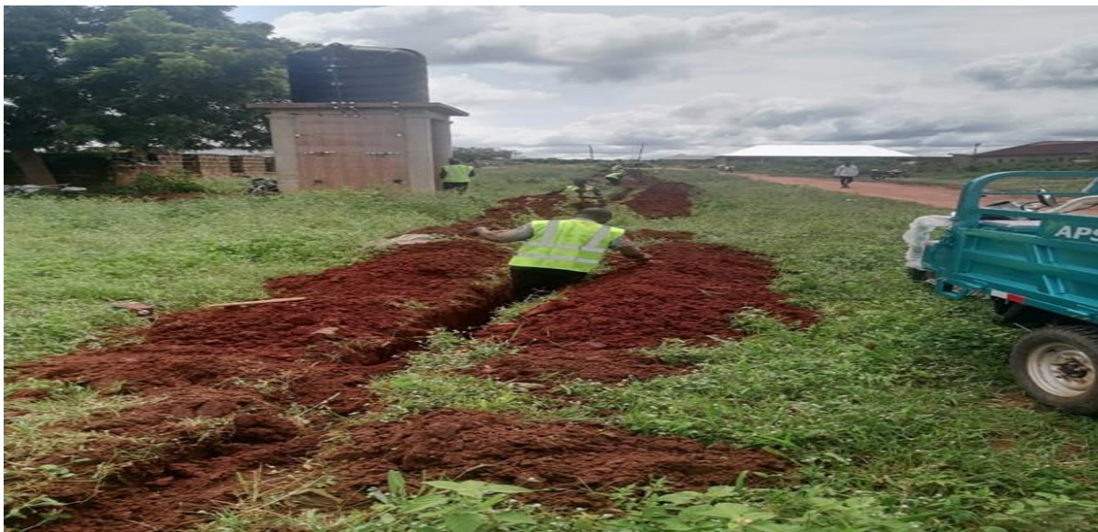
Trenching for pipe laying at Ejura