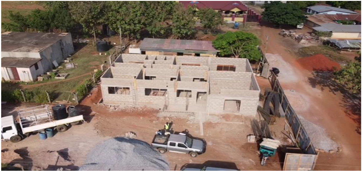
On-going construction of CWSA Office at Ejura