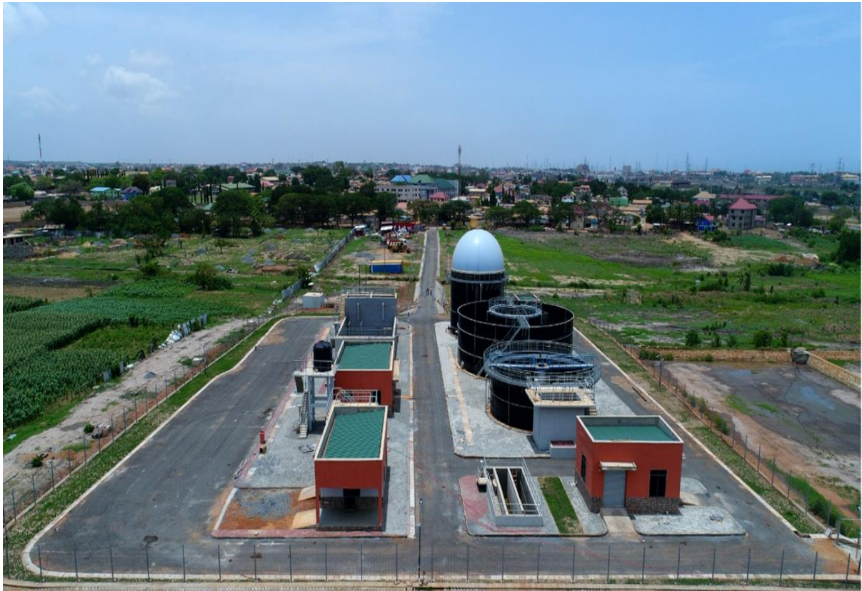
Ashaiman waste water treatment plant