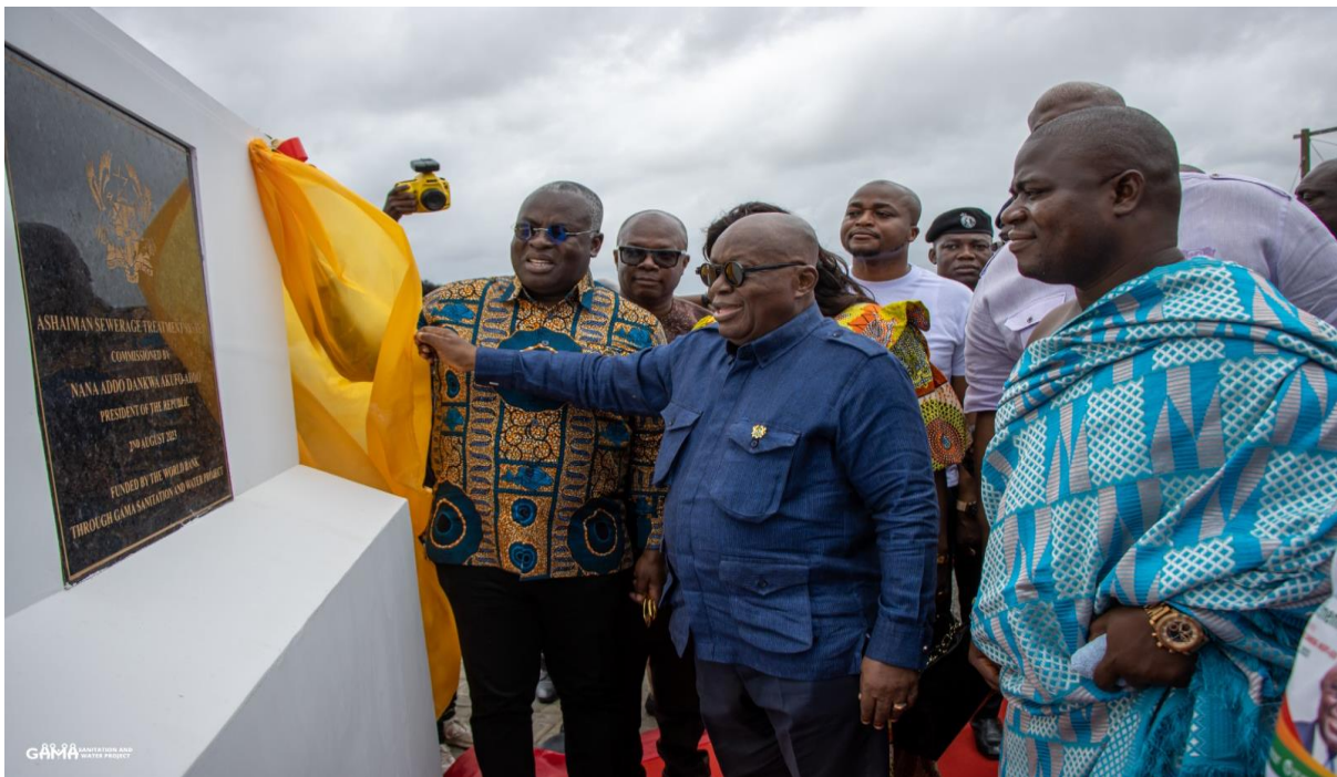
H.E the President Commissioning the Ashaiman Wastewater Treatment Plant