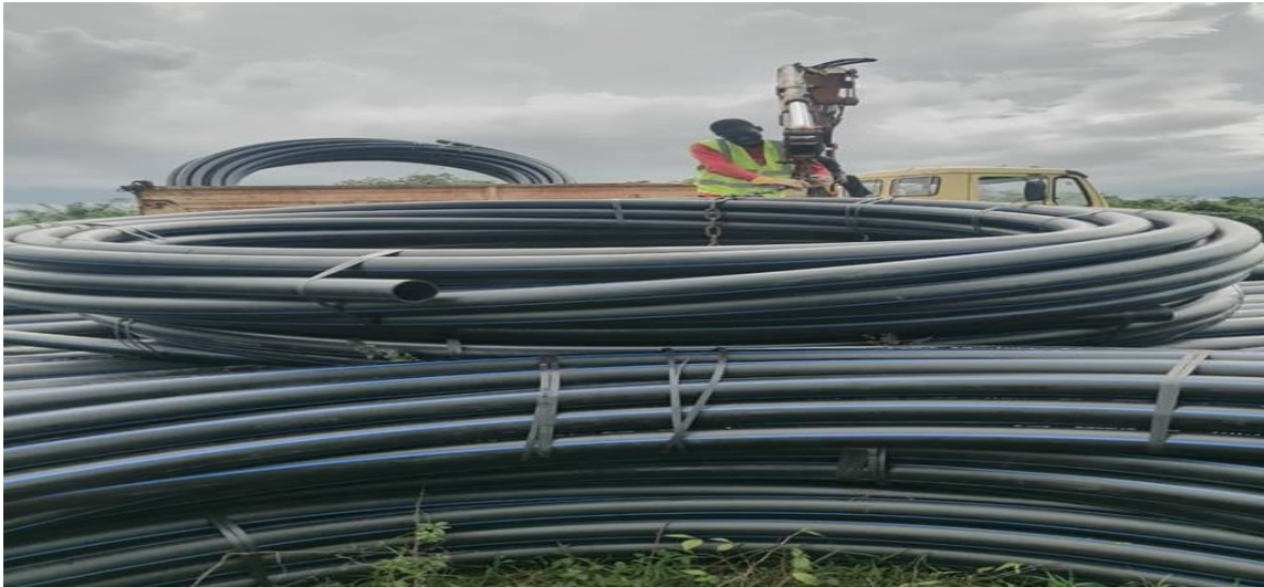
Pipe materials on site