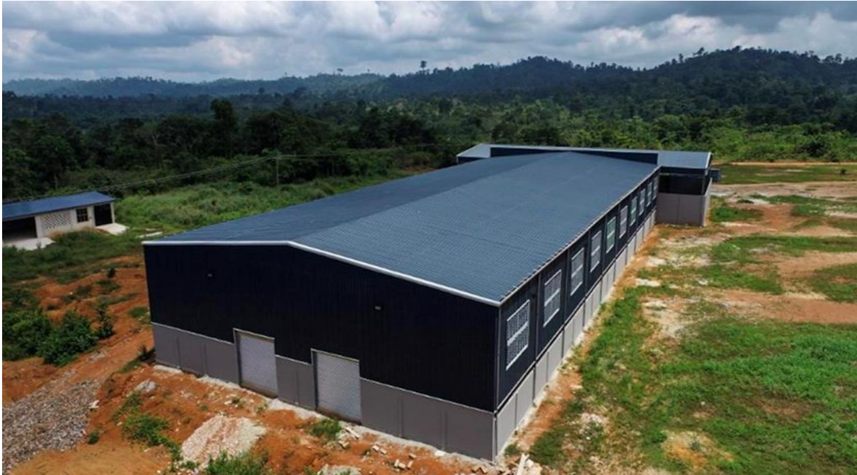
Construction of IRECOP facility at Sefwi Wiawso in the Western North Region

and organic compost among others. This is part of government's efforts to ensure efficiency in the collection, transportation and processing of solid waste into useful raw materials.