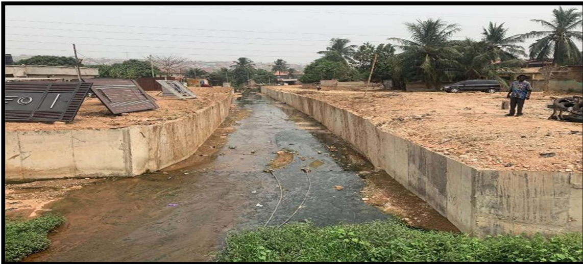
Figure 9: Korkordjor Storm Drain Project

The programme, though still ongoing, has completed the construction of 19km drains while more than 1,000km of drains have been excavated, rechanneled and maintained across the country towards reducing the perennial devastating floods. This has culminated in the reduced incidence of flooding across the project areas.