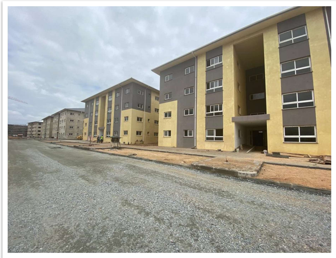
Figure 2: Security Services Housing Project (Phase III)

State Housing Company Limited (SHCL) in an attempt to address the nation's housing deficit has rolled out a number of housing projects across the country. To this end, the Urban Premier Housing Project Phase II comprising of 5no. unit apartment at Adenta which is now at its engineering and foundation stage while the Legacy Court Project which entails the construction of 12 houses, 7 town homes and 40 apartments is currently 100 percent complete and commissioned. Additionally, the Koforidua affordable housing project which entails the construction of 342 housing units is 27 percent complete.