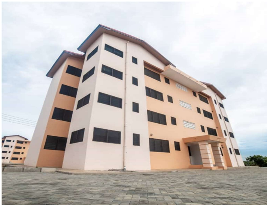
Figure 1: Kpone Affordable Housing Project

Also, the Ministry in collaboration with State Housing Company Limited (SHCL) has commenced works on the preparation of the District Housing Programme for the construction of rental housing units at the District Level for public servants over the