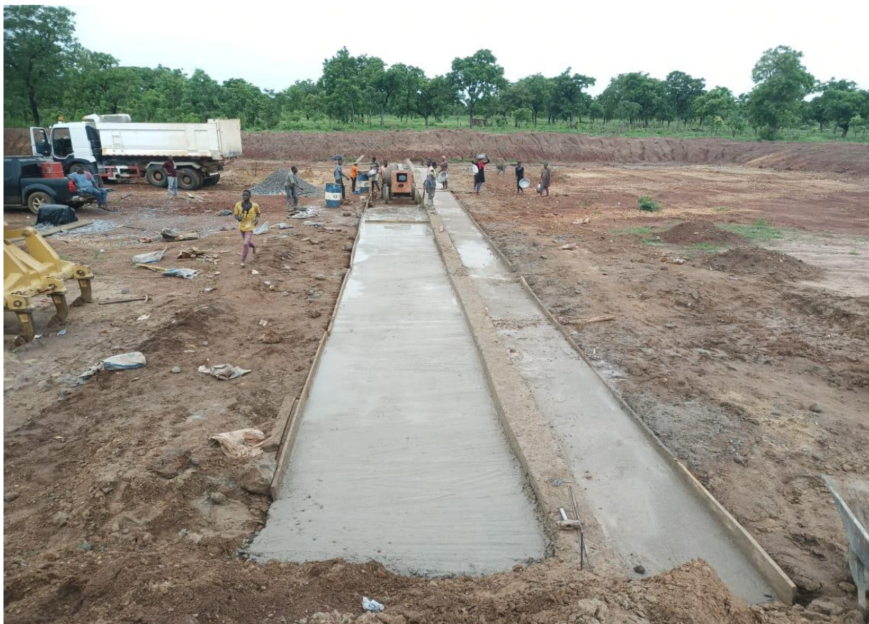
Construction of spillway control structure