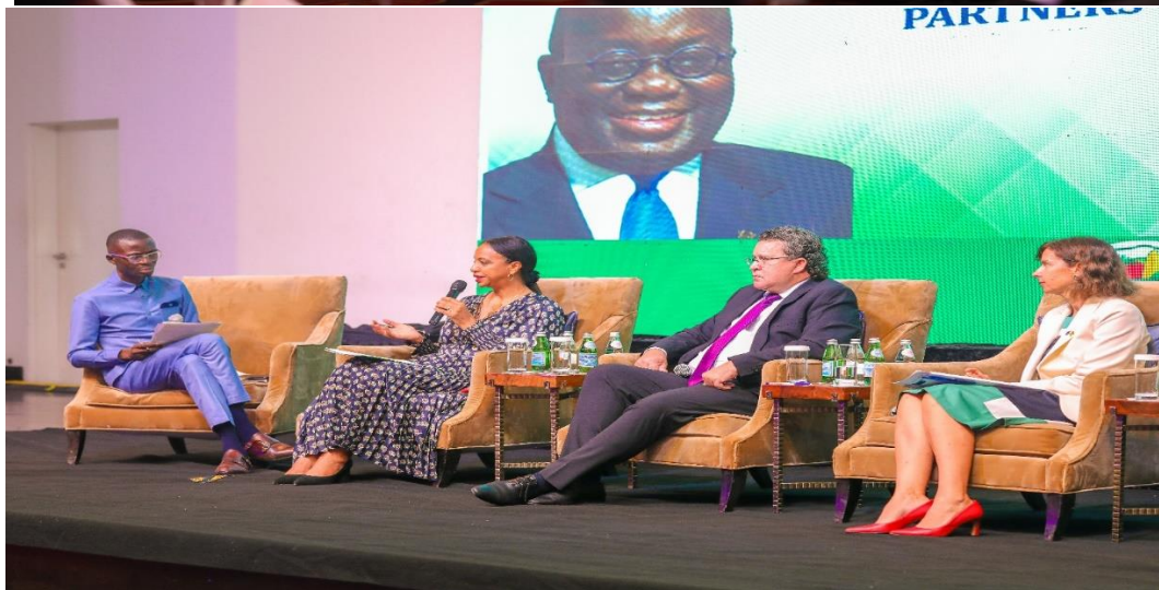
Discussants at the President Roundtable Discussion with Development Partners on PFJ 2.0.