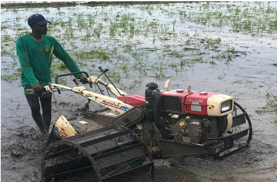
Power Tiller on Irrigated Rice Fields