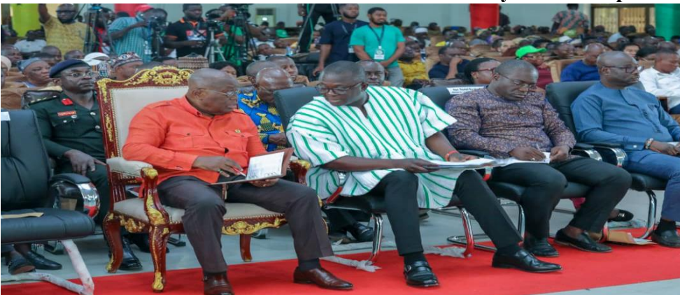
His Excellency Akufo Addo and the Minister for Food and Agriculture Dr. Bryan Acheampong (MP) at the Launch of PFJ 2.0