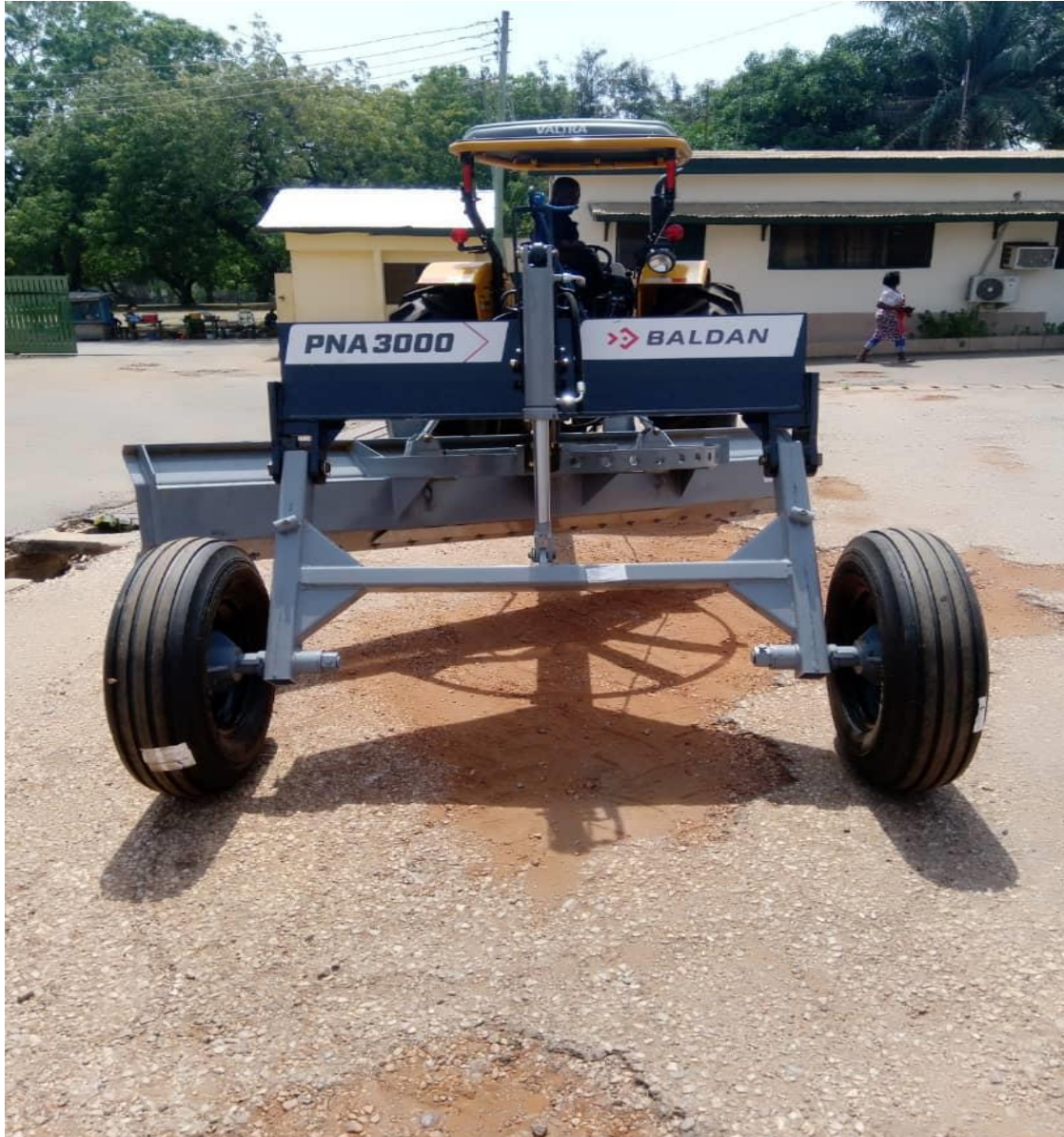
Tractor Mounted Rear Levelling Blade (For Grading and levelling earth material (soil))