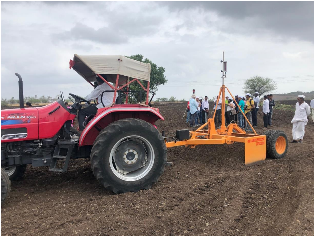
Land Laser Leveller (For levelling fields)