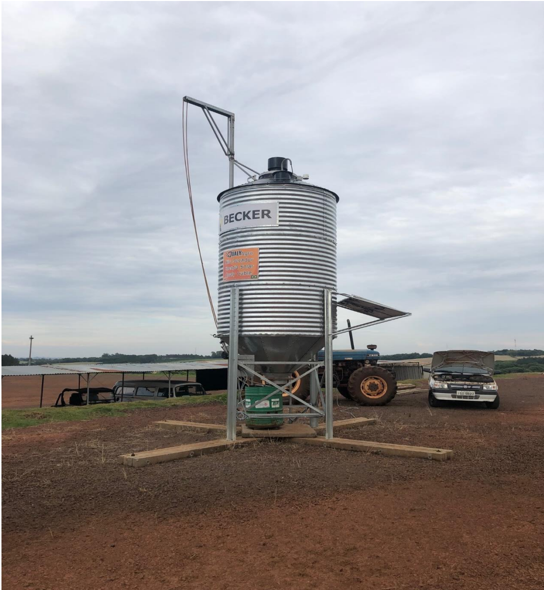
Solar Silo Dryer for Grains