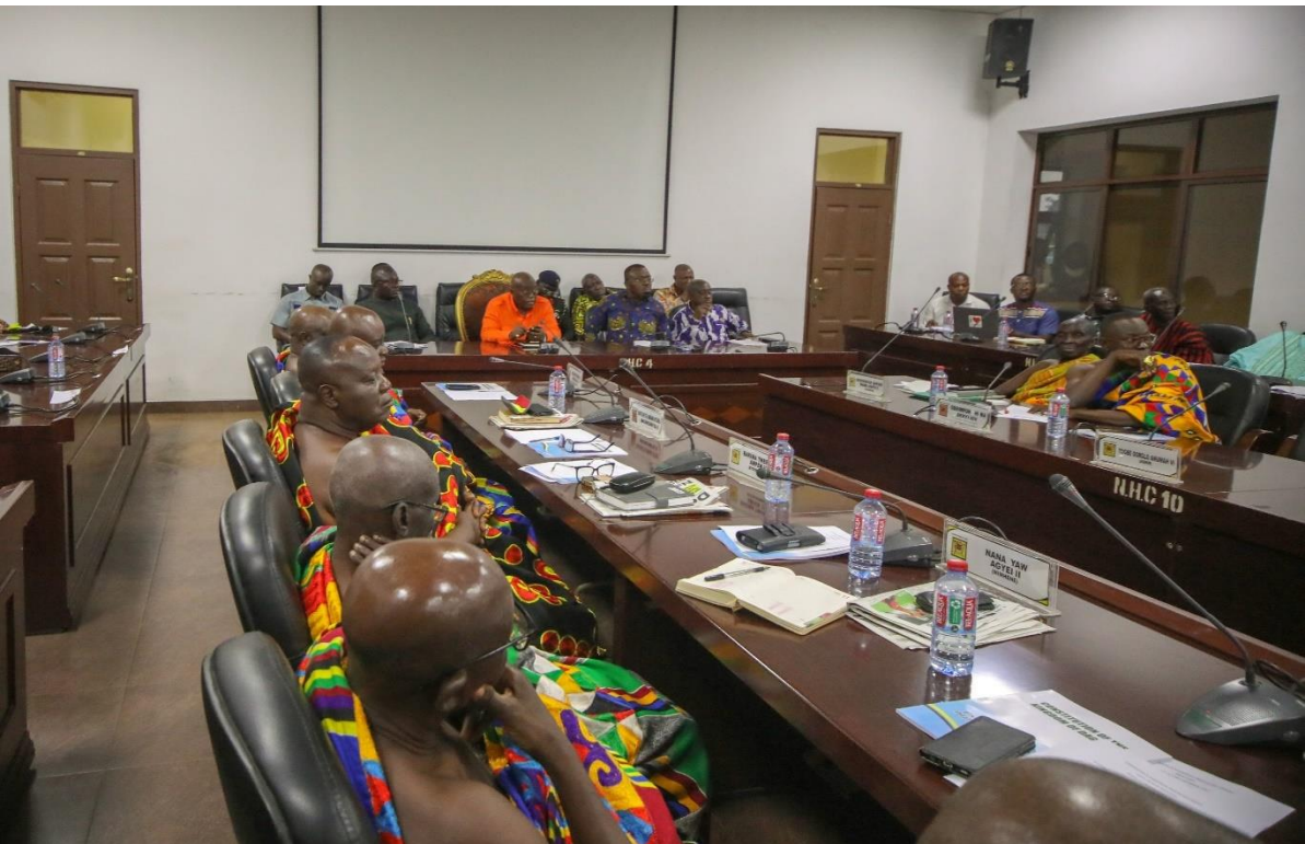
A section of the President Engagement with Chiefs and Traditional Rulers to release land for Commercial Agriculture.