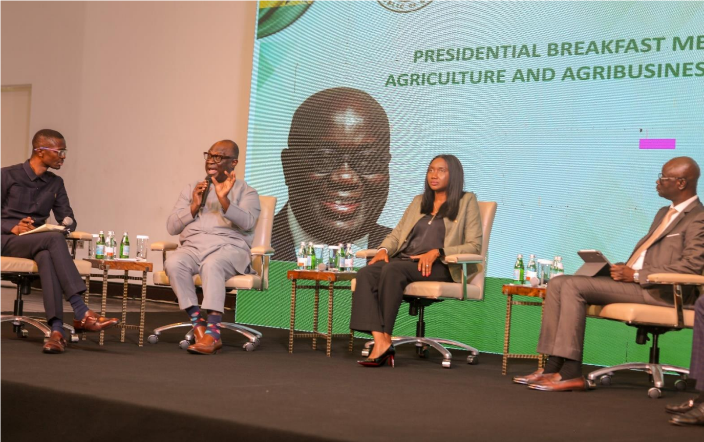
Discussants at the President Breakfast Meeting with Financial Institutions on Agribusiness Financing