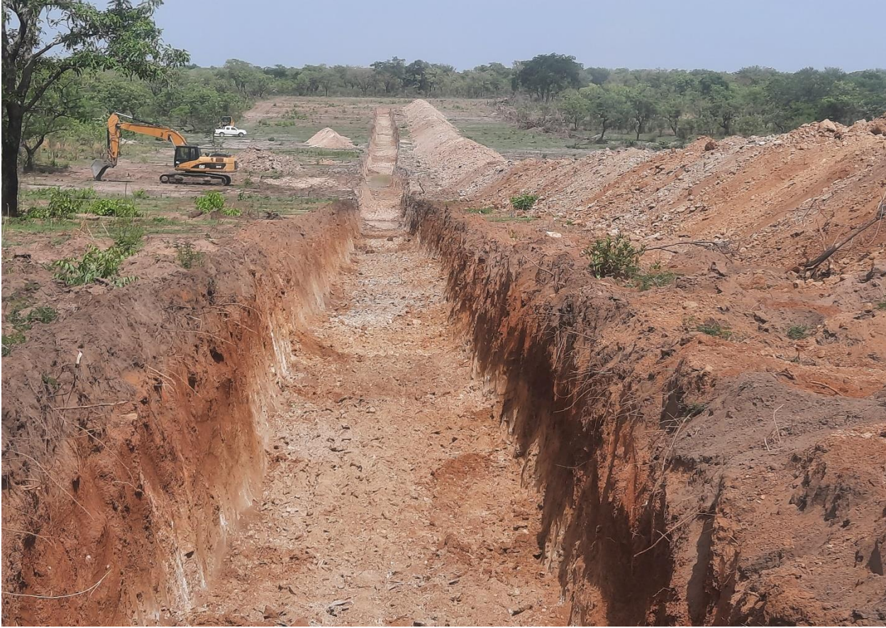
Key trench excavation