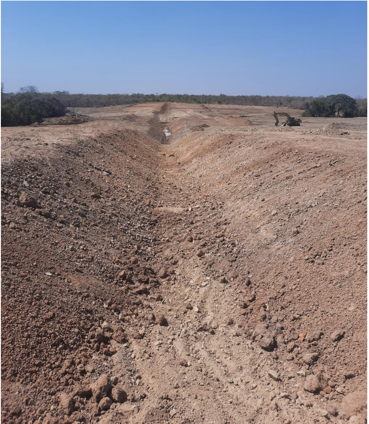
Plate 1: Excavated Key trench along the dam axis