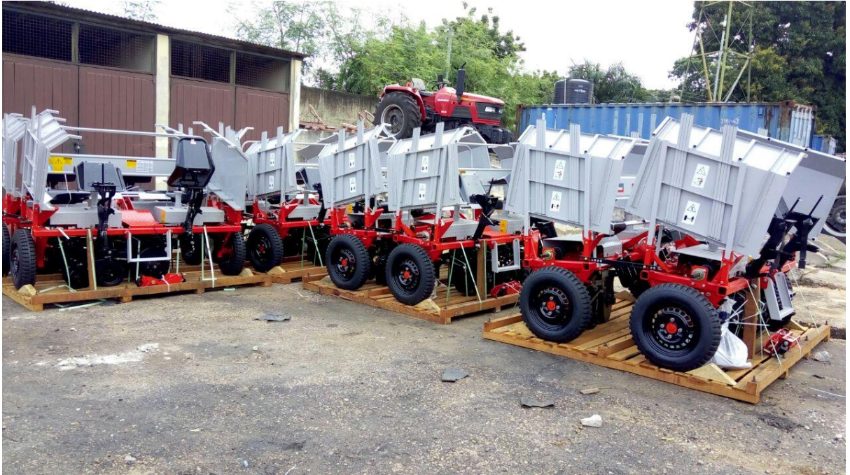
Tractor trailed 4 - Row Cassava Planters