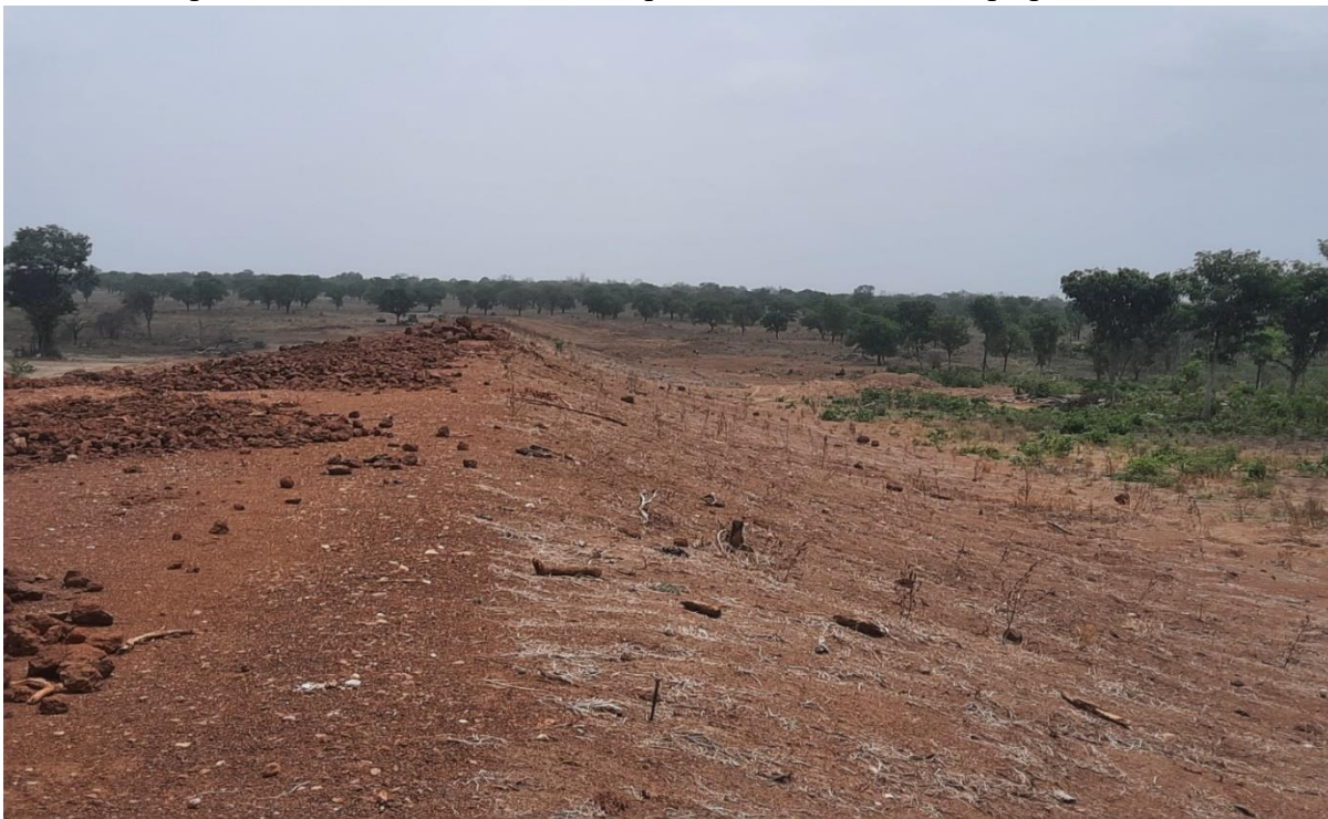
Downstream slope of dam ready to receive vertiva grass