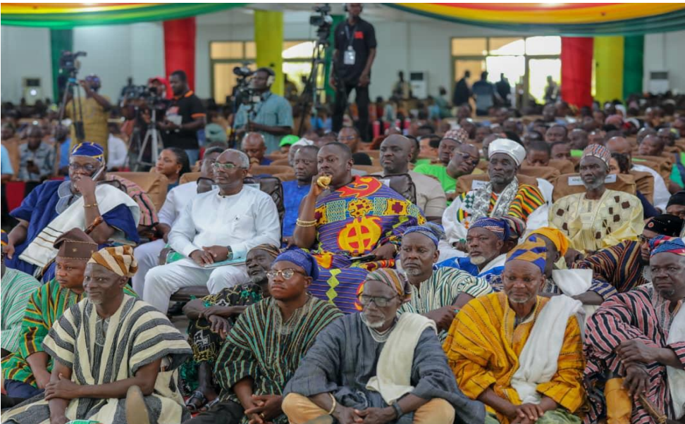
A Section of Audience at the Launch of PFJ 2.0 -University for Development Studies, Tamale