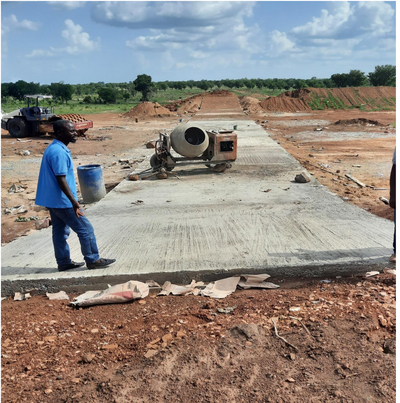
Completed spillway (Irish crossing) undergoing curing.