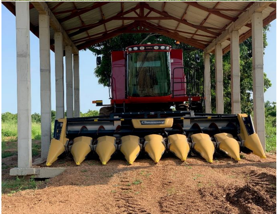
8-Row Maize Case IH Combine Harvester