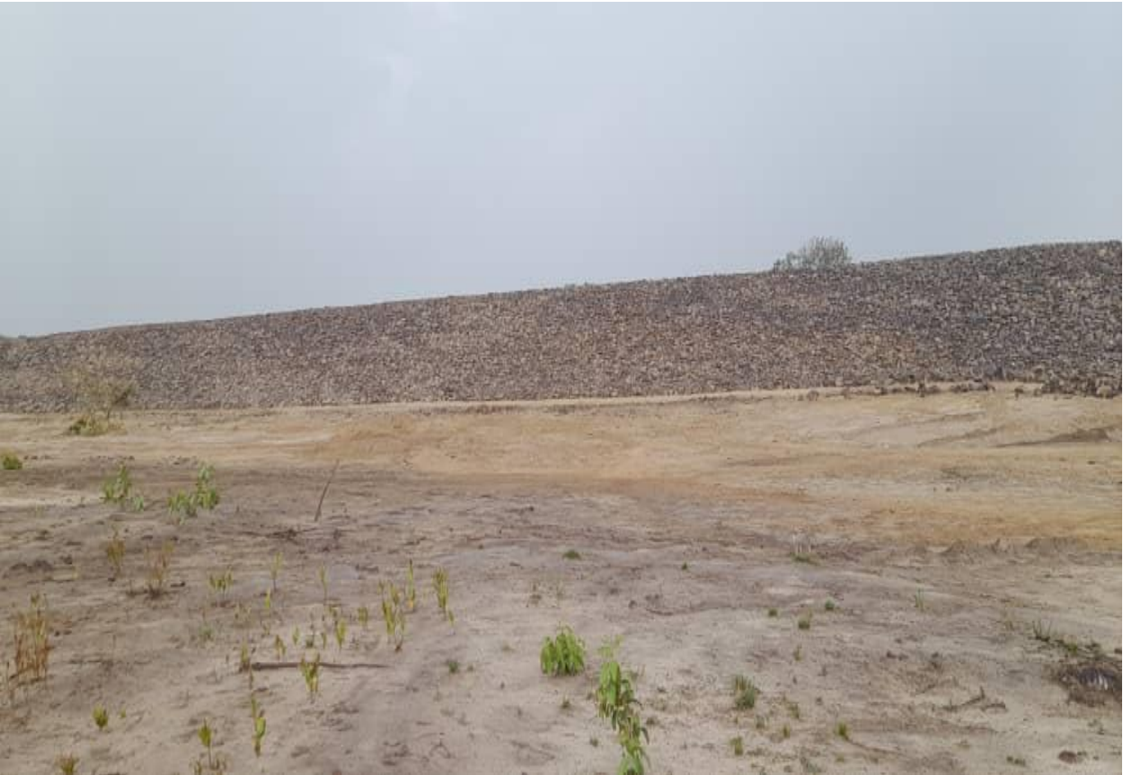
Plate 2: Boulders placed on the upstream slope of the dam for slope protection