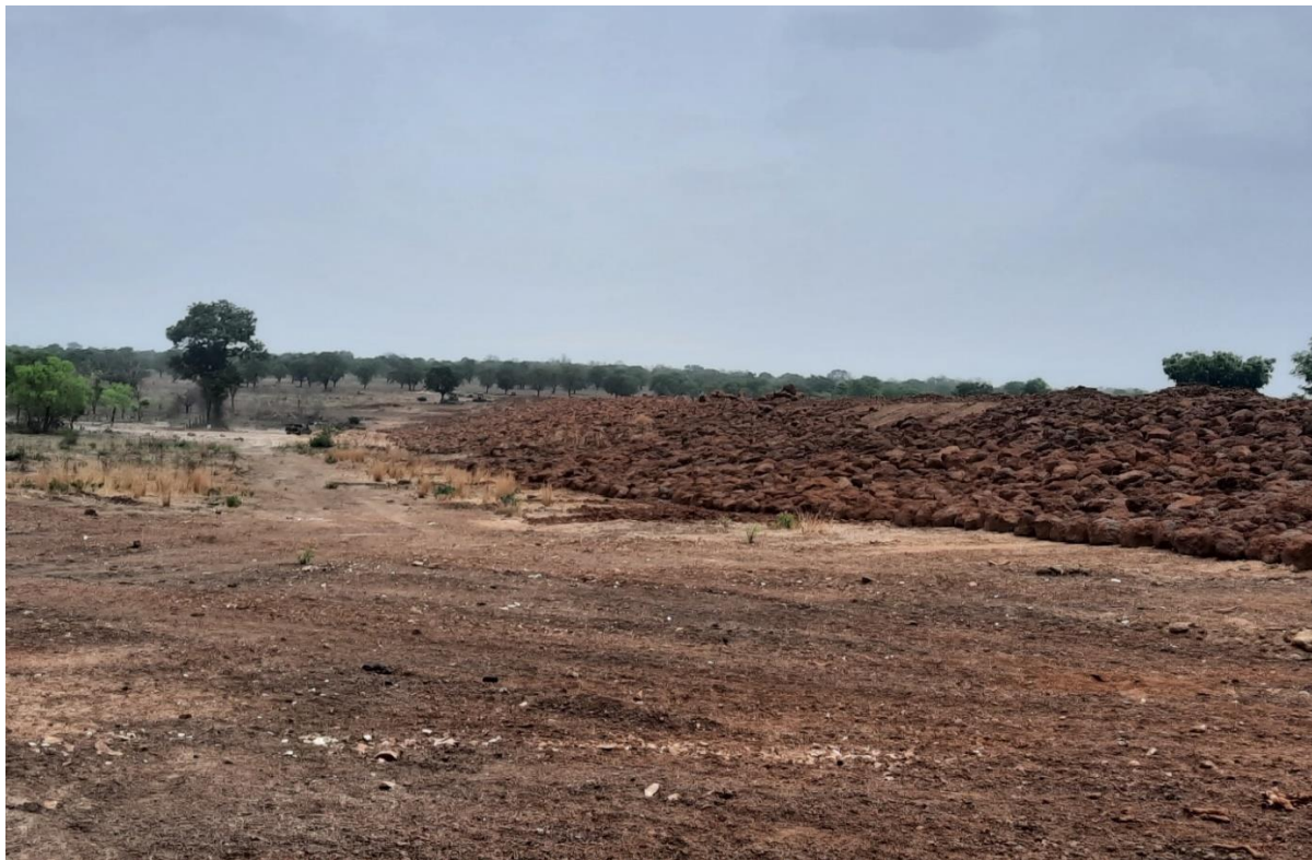
Plate 1: Completed Dam embankment with upstream boulders for slope protection