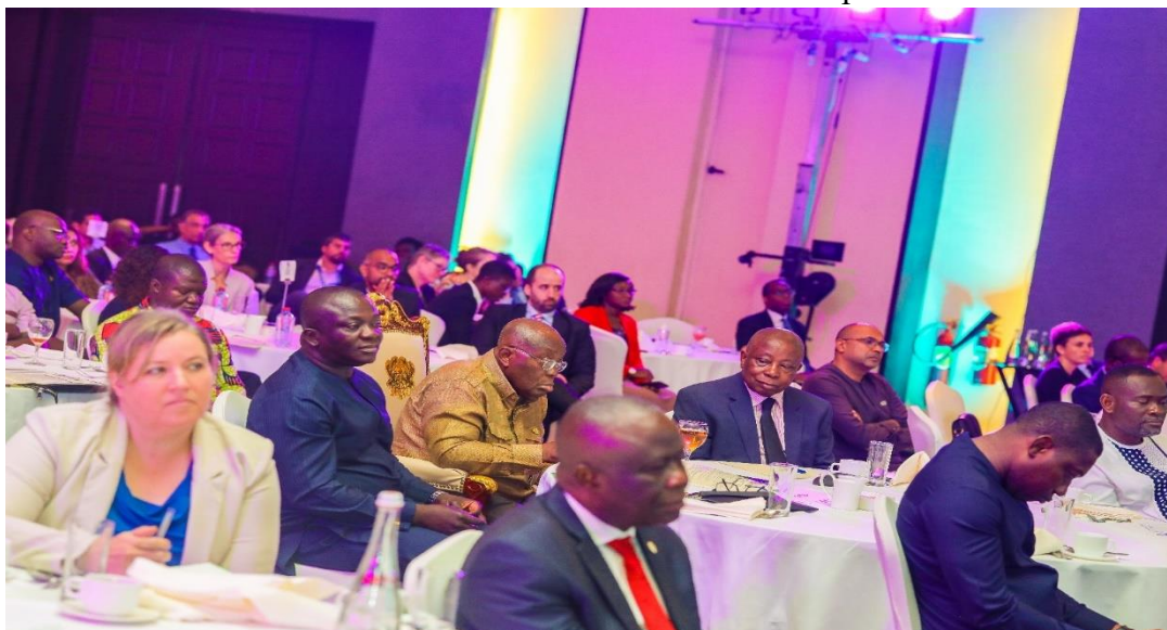
The President, flank by Ministers of Food and Agriculture and Health at the Roundtable Discussion with Development Partners on Areas of collaboration for the implementation of PFJ 2.0.