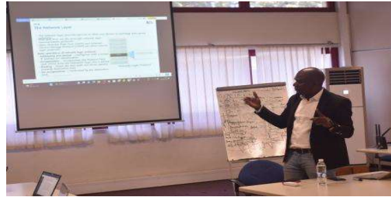
A cross section participants in the SADA training

GI-KACE completed the prototype KACE Content Access Point (K-CAP), specially designed to make educational content readily available offline for pre-tertiary schools. This initiative stands as a testament to the government's commitment to improving access to quality education through ICT. In collaboration with esteemed partners, GI-KACE also developed and deployed the Digital Skills Platform for Ghana, working alongside the World Bank and Microsoft, this initiative is a significant step forward in equipping Ghanaians with essential digital skills for the modern era.