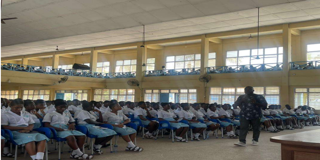
A cross section of students participating in the COP sensitization in the Northern Region

The 2023 edition of the National Cybersecurity Challenge (NCC) created awareness on child online safety practices through a competition on cybersecurity-related issues among fifty (50) selected Senior High schools drawn from the Ashanti and Northern Regions of Ghana. As part of the awareness creation and capacity building on the COP provisions in the Cybersecurity Act, 2020 (Act 1038), 83,293 students in the 50 Senior High Schools were sensitized.