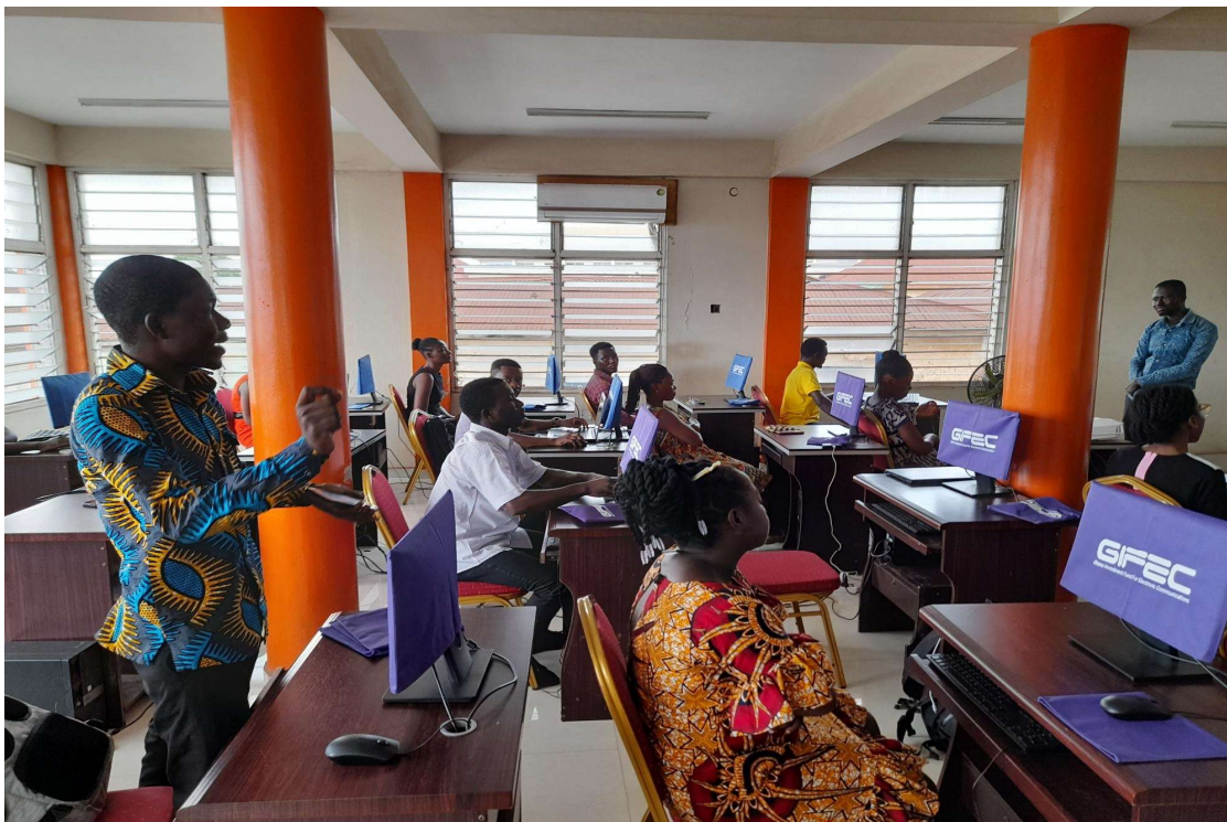
Training workshop in one of the CICs

The Ghana Investment Fund for Electronic Communications (GIFEC) has established a network of 281 vibrant Community Information ICT Centres (CICs) with continuous support for the existing centres. GIFEC has also introduced a new model with 30 units, of which six new model centres are operational, with 3 already commissioned (Agona Abodom, Kokofu and Tolon).