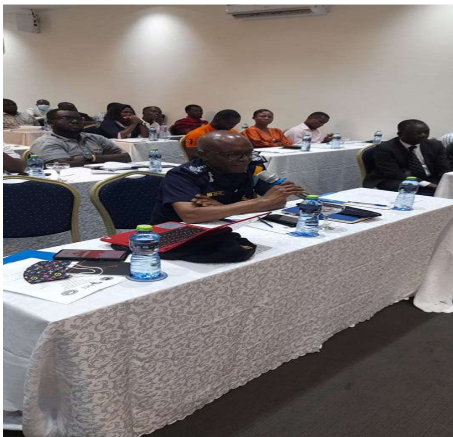
Workshop on the use of digital technology