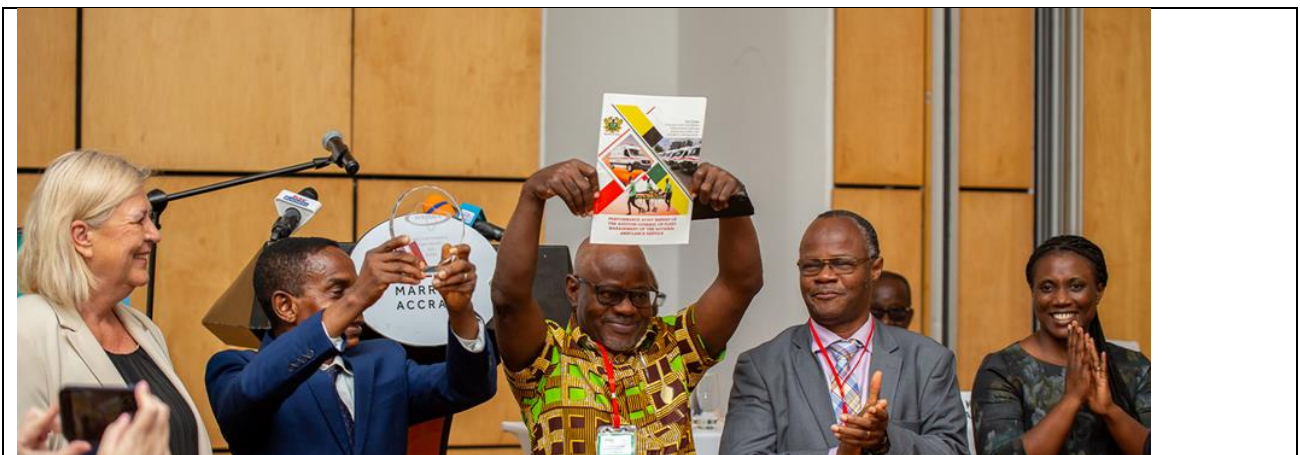
Figure 5: Audit Service management with the AFROSAI-E Award

Audit Service was awarded the prize at the 2023 AFROSAI-E Strategic Review and 19 th Governing Board Meeting held in Accra from 8 th to 11 th May 2023. The report titled: “Fleet Management of the National Ambulance Service” was unanimously declared as the winning report by an independent international jury after the review of reports presented for the award.