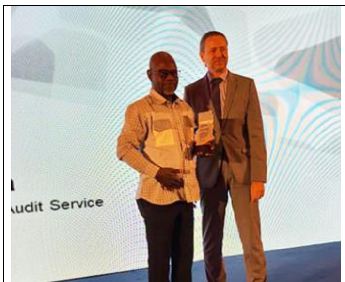
Figure 4: Audit Service DAG for PSAD with the award