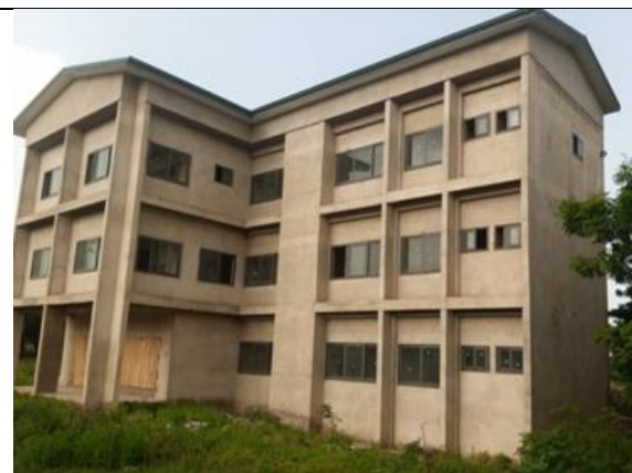
Figure 3: Progress on the Tamale Regional Office Project