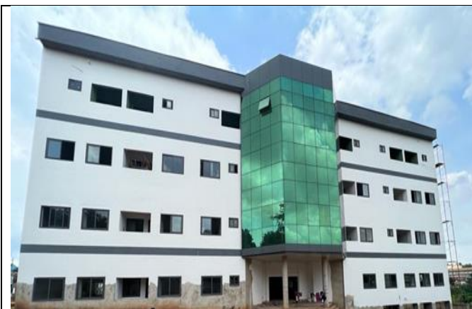
Figure 2: Progress on the Kumasi Regional Office Project