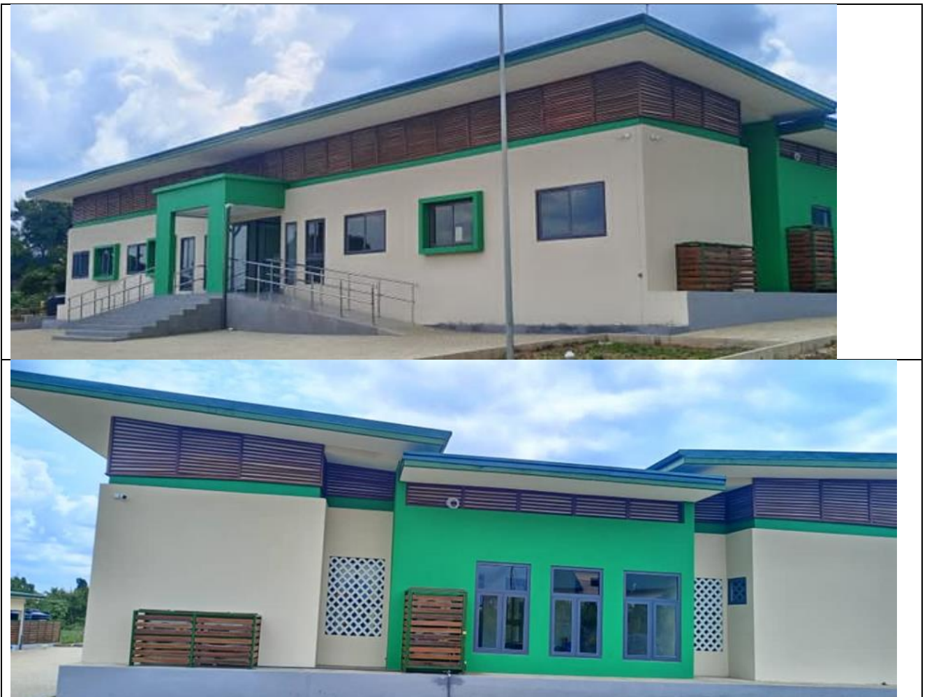
Figure 1: Progress on construction of KfW Offices