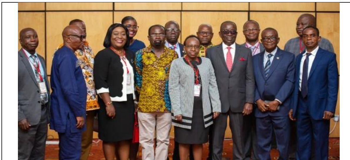
Figure 6: Audit Service Board Members, Management, and Other Dignitaries at the Award Ceremony