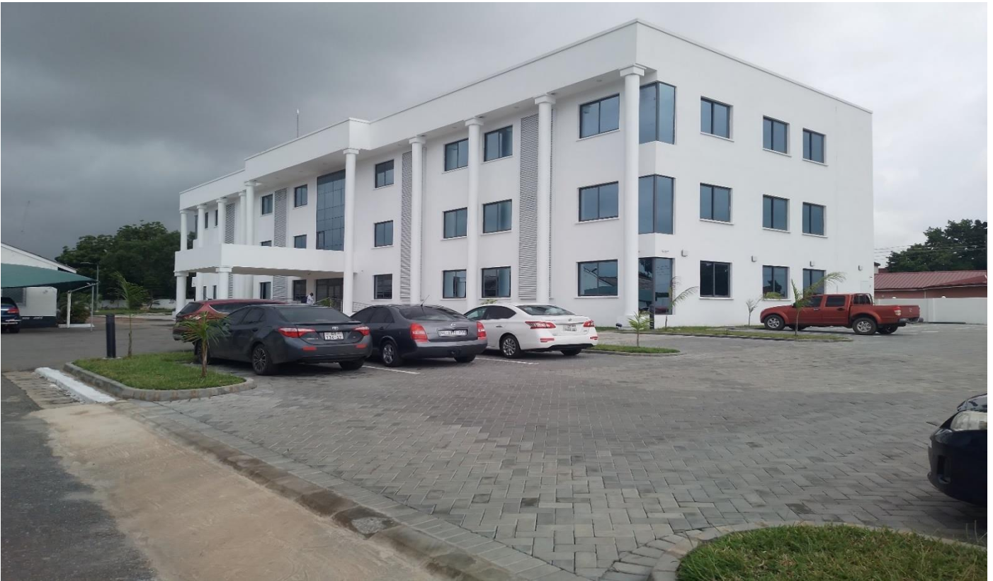
CDS Office Building