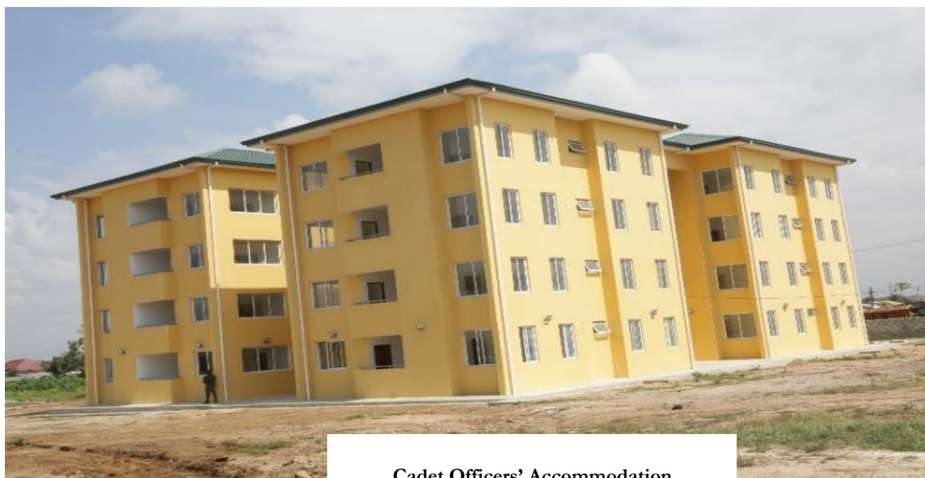
Cadet Officers' Accommodation