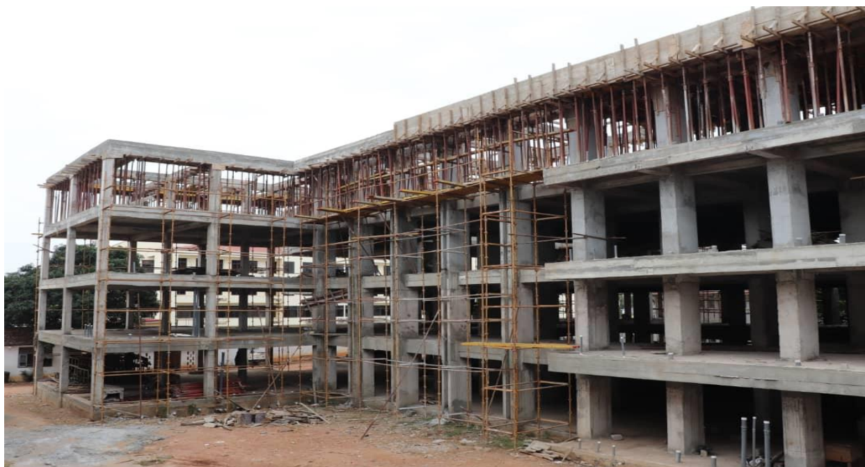
Reconstruction of burnt section of the Old Parliament House – WIP