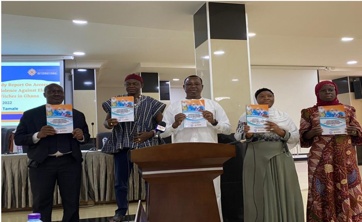
Baseline Assessment Report – Crossroads