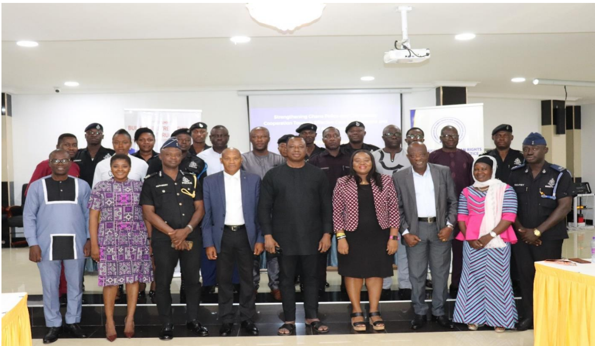
Police Accountability Program