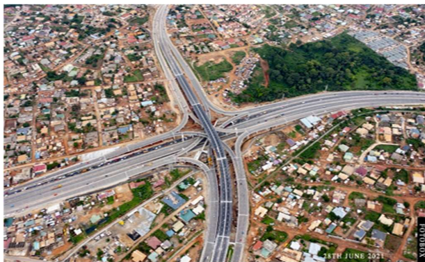
Pokuase Interchange (Accra Urban Transport Project)