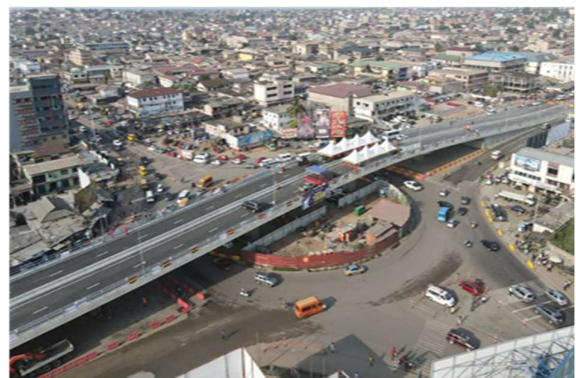
Obetsebi Interchange (Phase 1)