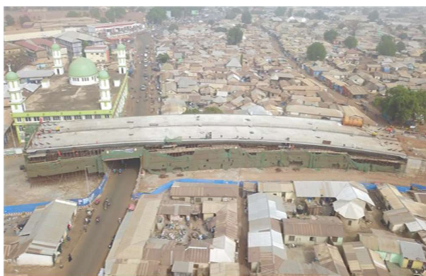
Tamale Interchange (Sinohydro Phase 1)