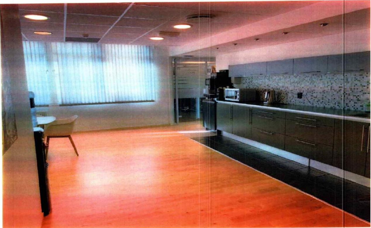
Photo: Kitchen and Dining area at the Chancery