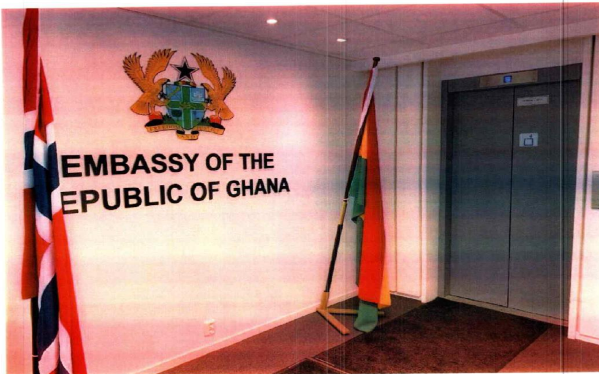
Photo: Main entrance/exit at the Chancery accessible by an elevator