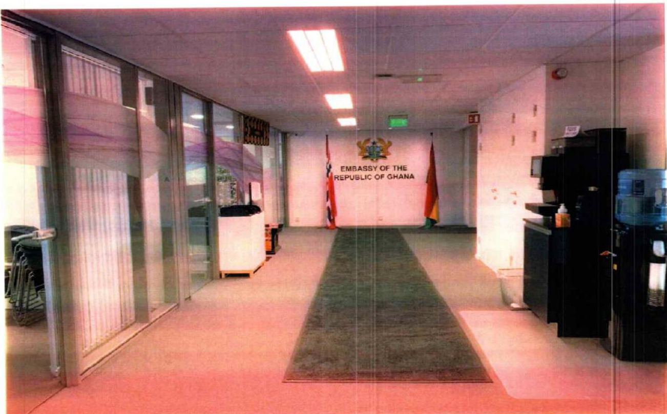
Photo: Reception Area (the Front Desk office, Driver's Room and Waiting Room are located here)