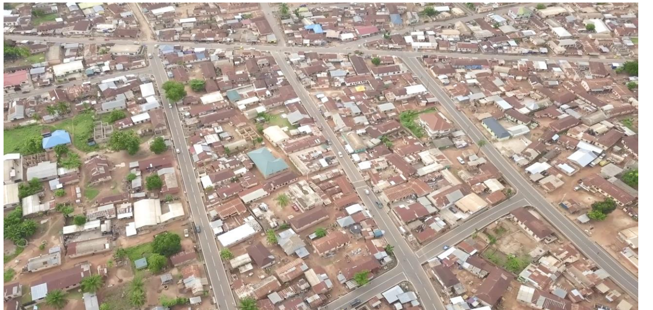
Asphalt Overlay of Hohoe Town Roads