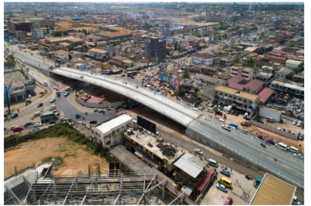
Obetsebi Interchange (Phase 1)