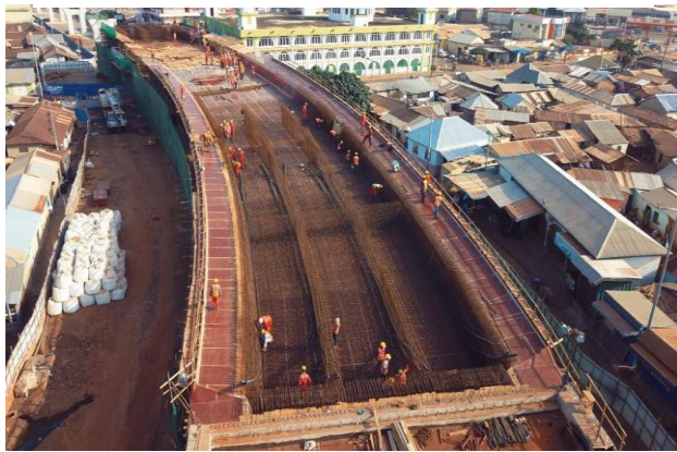
Tamale Interchange (Sinohydro Phase 1)