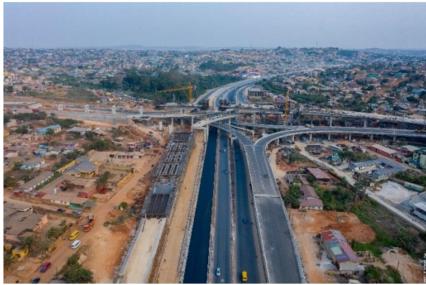
Pokuase Interchange (Accra Urban Transport Project)