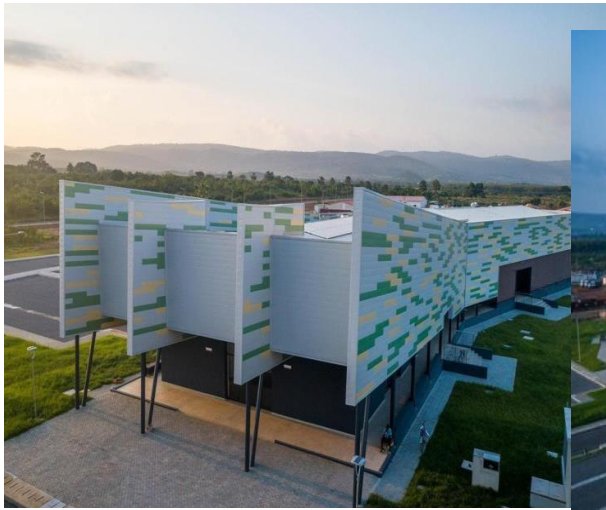
Multi- Purpose Hall