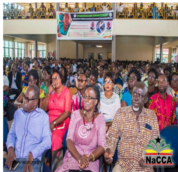
Stakeholder Engagement - Curriculum Review and Assessment