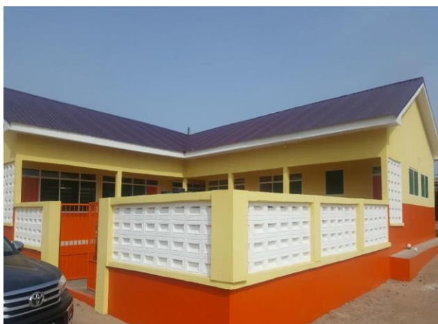
6- UNIT CLASSROOM BLK AT BA PRIM. SCHOOL

Government recognizes the important role of infrastructure expansion in achievement of the Sustainable Development Goals. In view of that, a total of 874 projects have been initiated since 2017, of which 323 have been completed. In addition, Government has supplied furniture including dual desk, teacher's table and chairs, library tables and chairs, book shelves and hexagonal tables and chairs to basic schools across the country.