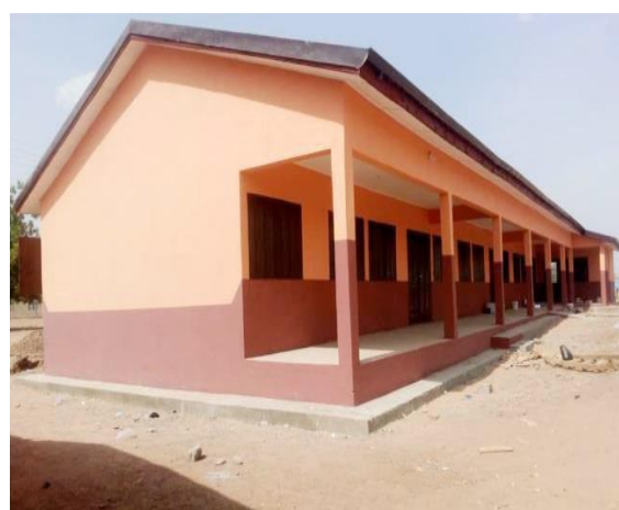
3-UNIT JHS BLK AT SINIENSI (BUILSA NORTH)