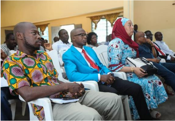
Legal Aid provided to vulnerable communities in Cape Coast Municipality in collaboration with UCC law faculty