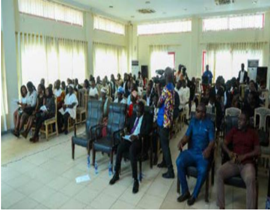
Bursary support provided for 15 students