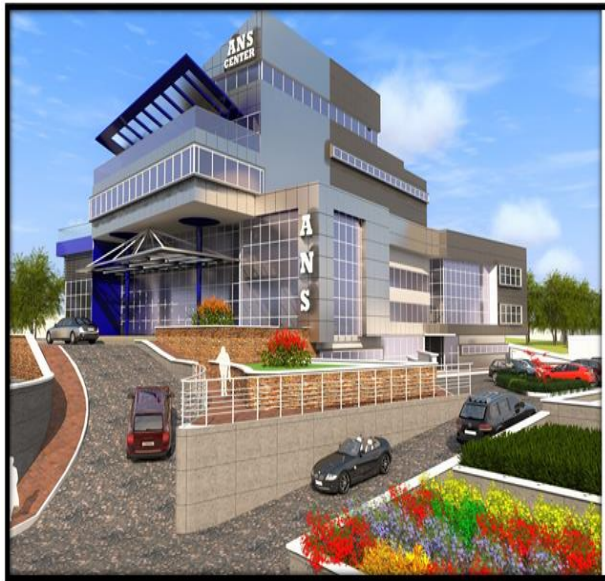
Artist impression of the ANS building at KIA