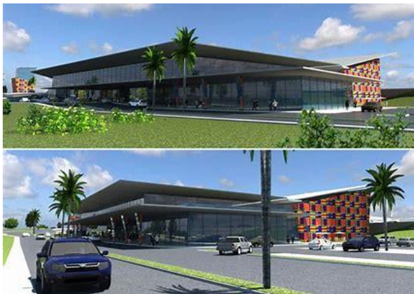
Artist impression of Kumasi airport phase II