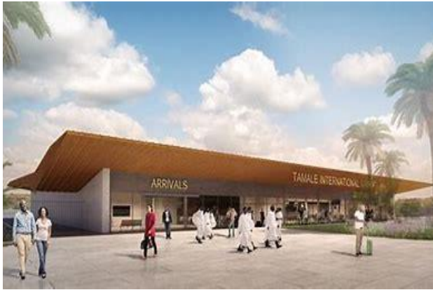
ICAO Team in Ghana during ICVM Audit