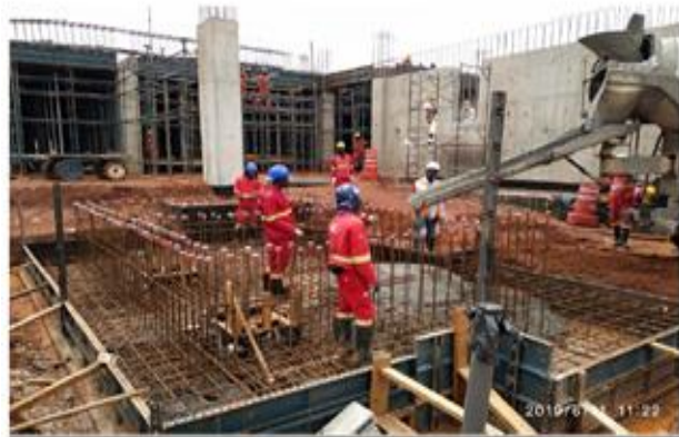
on-going works of Kumasi airport phase II