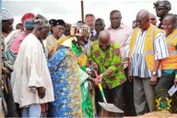
Artist impression of the Tamale airport phase II, H.E the president and Hon. Min during sod cutting