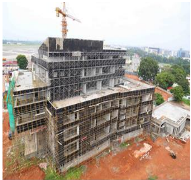
on-going construction of ANS building at KIA