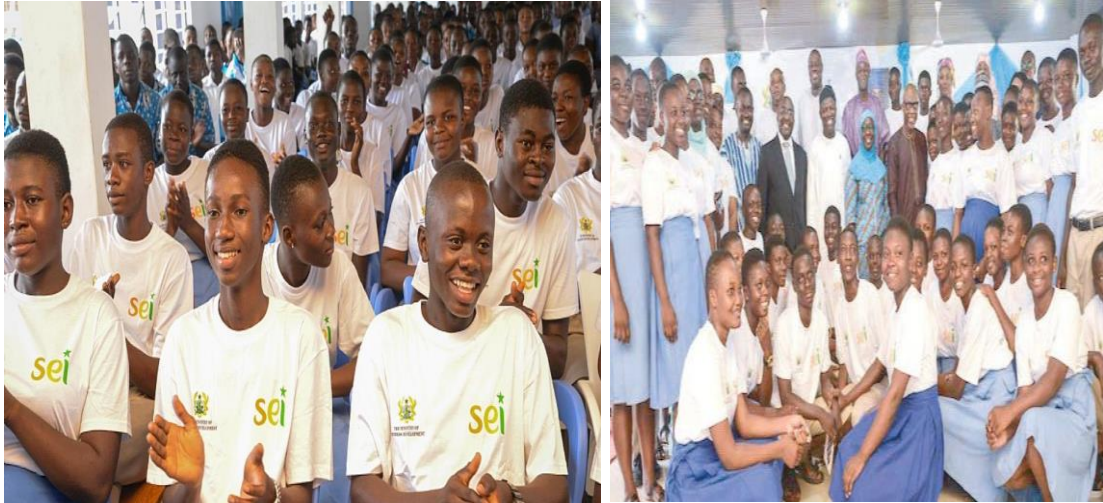
Images of some of the SEI (SHS) clubs