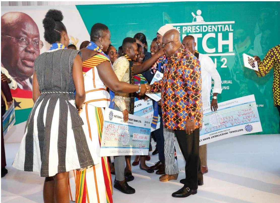
His Excellency, The President congratulating the Winners