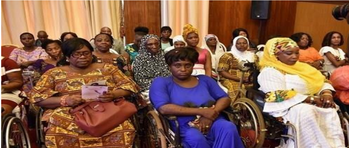
Picture of some of the women entrepreneurs with disability

As part of the Presidential Empowerment for Women Entrepreneurs with Disability (PEWED) programme, 100 women entrepreneurs have been trained and given funding to scale up their businesses.