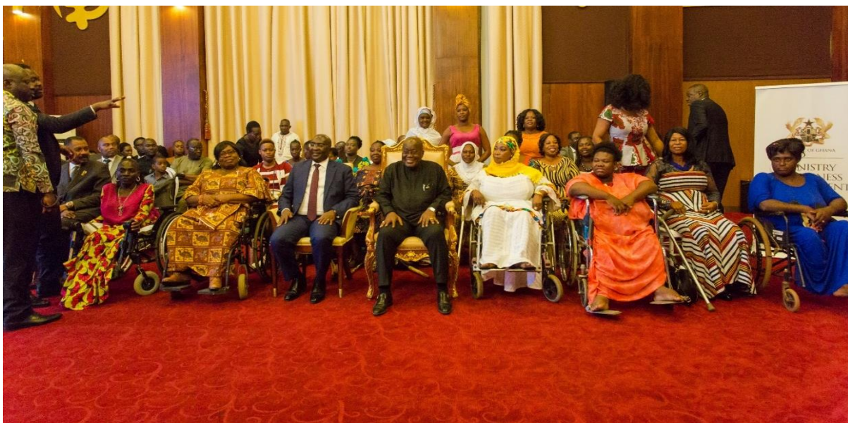
Picture of His Excellency, The President and The Vice with Women with Disabilities at the launch