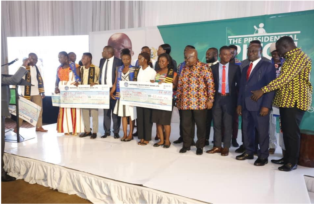
Group picture of the winners with President Nana Addo Dankwa Akufo-Addo