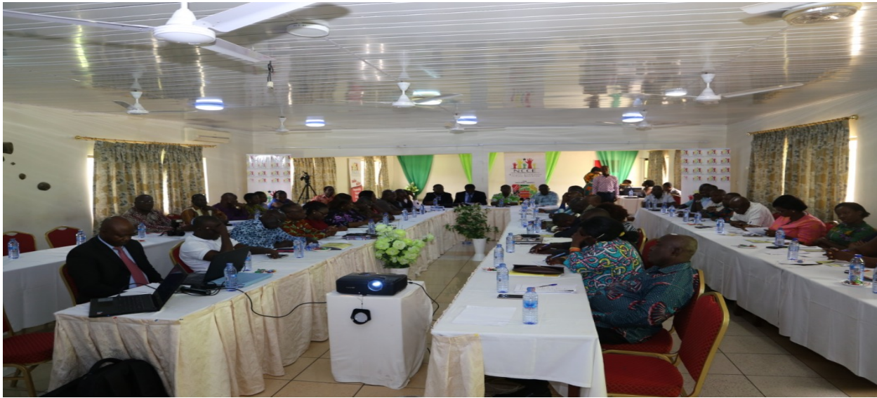
CAPACITY BUILDING ON PFM ACT, 2016 (ACT 921) FOR SELECTED STAFF 1