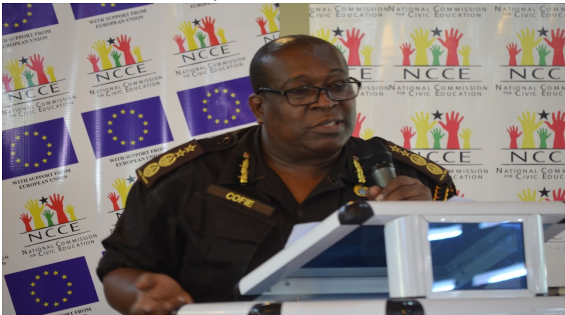
PRISONS BOSS CONTRIBUTING TO CIVIC EDUCATION 1