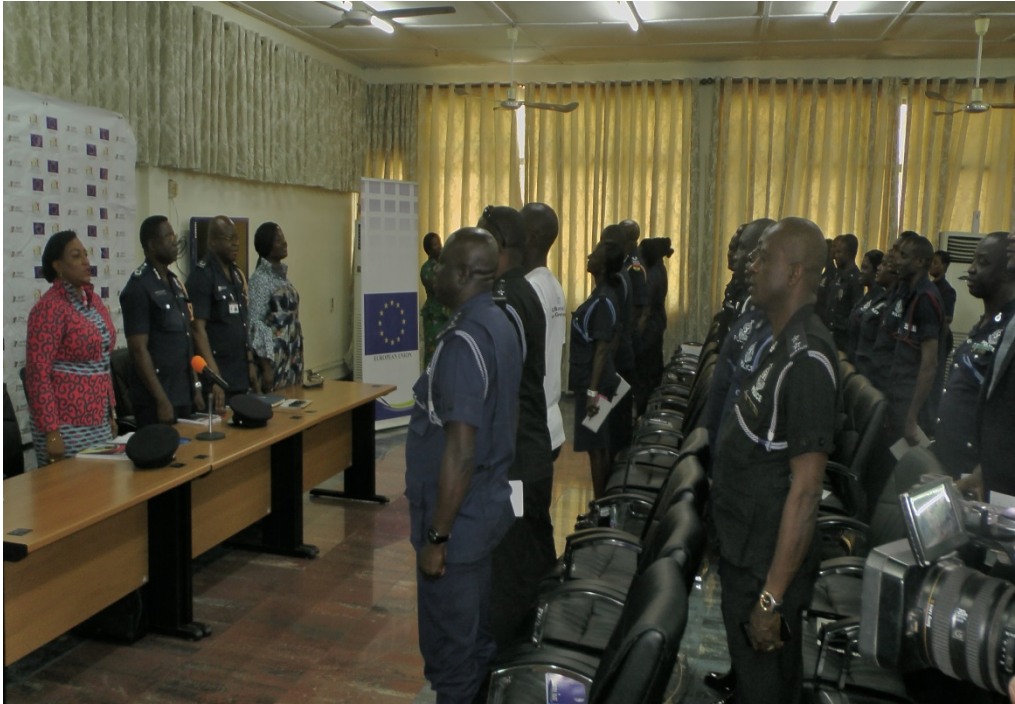
MAD NKRUMAH WITH GHANA POLICE SERVICE 1