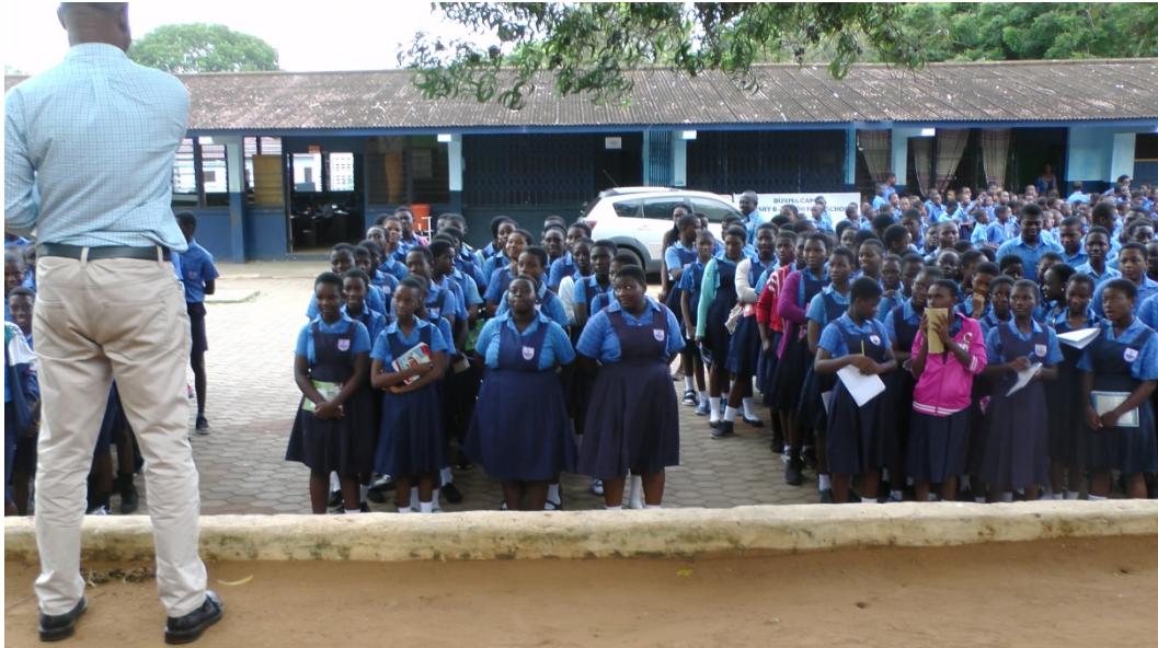
PUPIL OF BURMA CAMP JHS 1