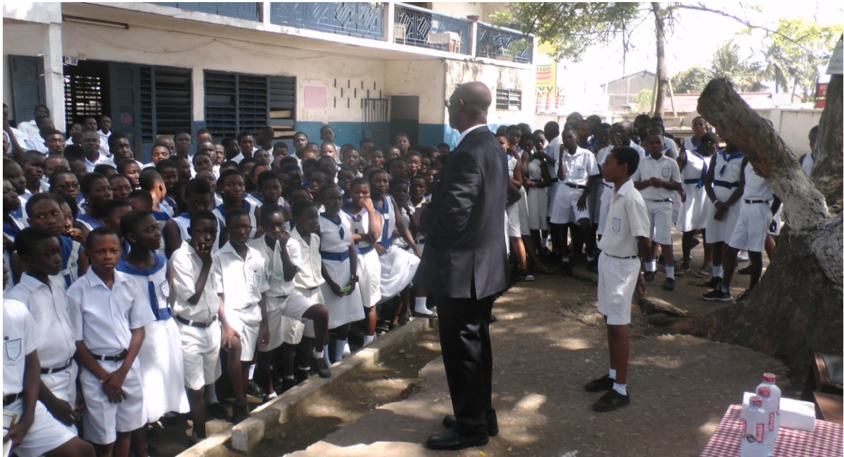
TAX EDUCATION BY GRA BOSS 1