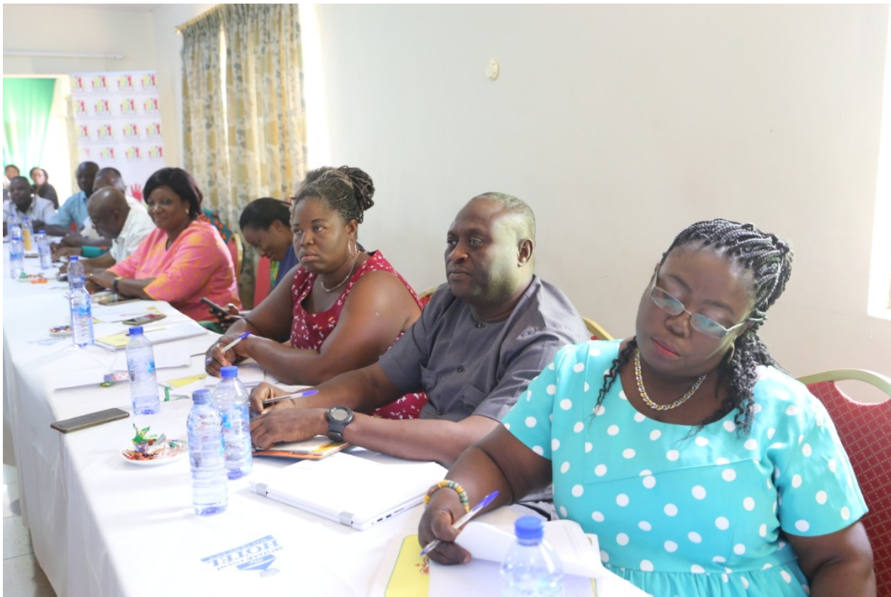
CAPACITY BUILDING FOR SELECTED STAFF 2