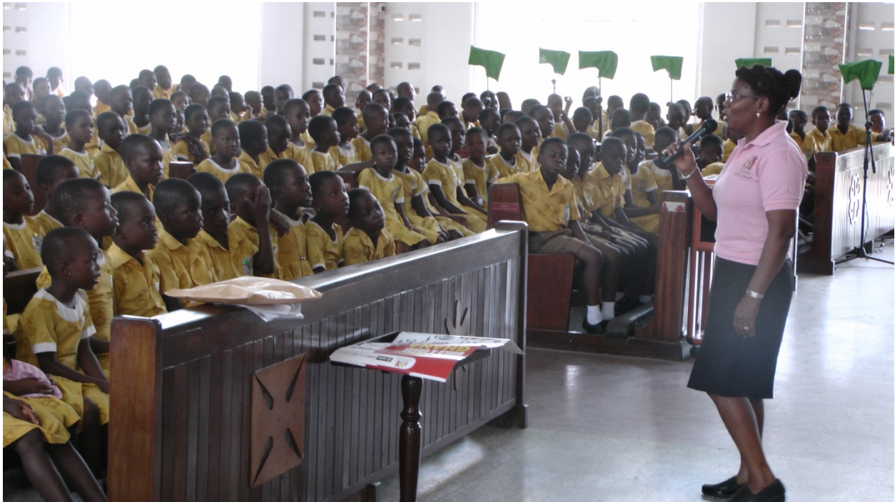
CCA DIRECTOR ON TAX EDUCATION 1