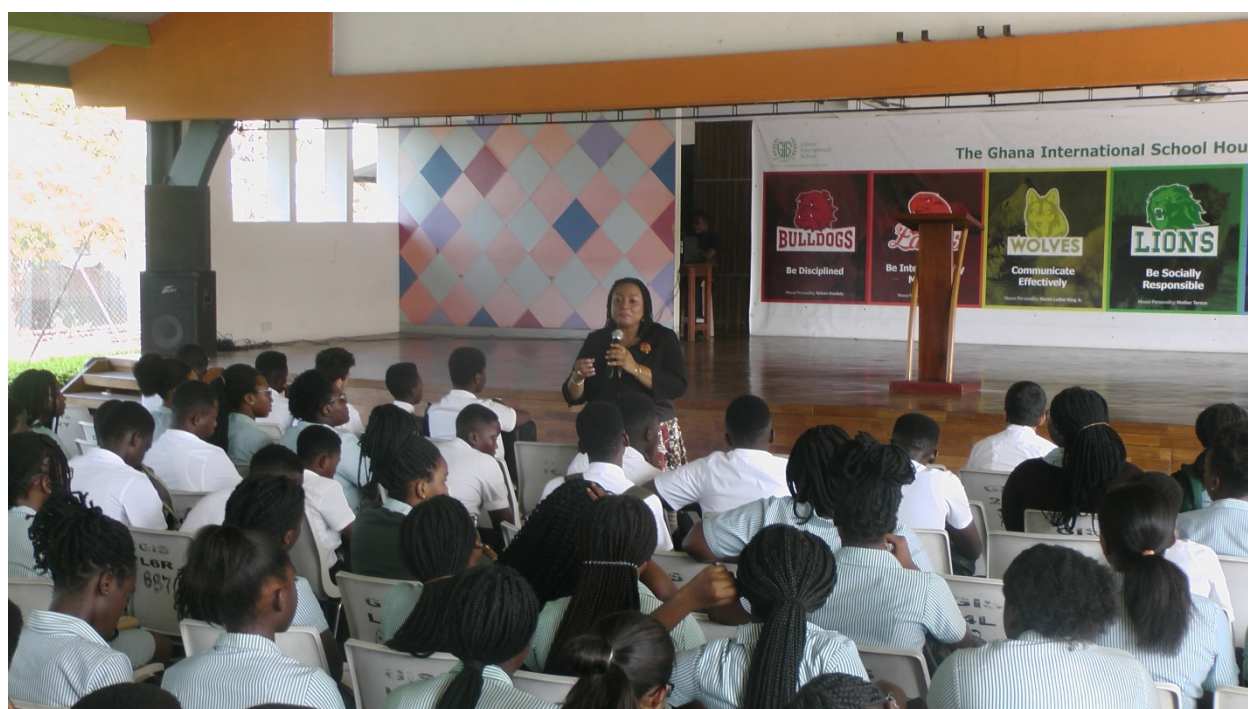
MAD NKRUMAH AT GHANA INT. SCHOOL 1