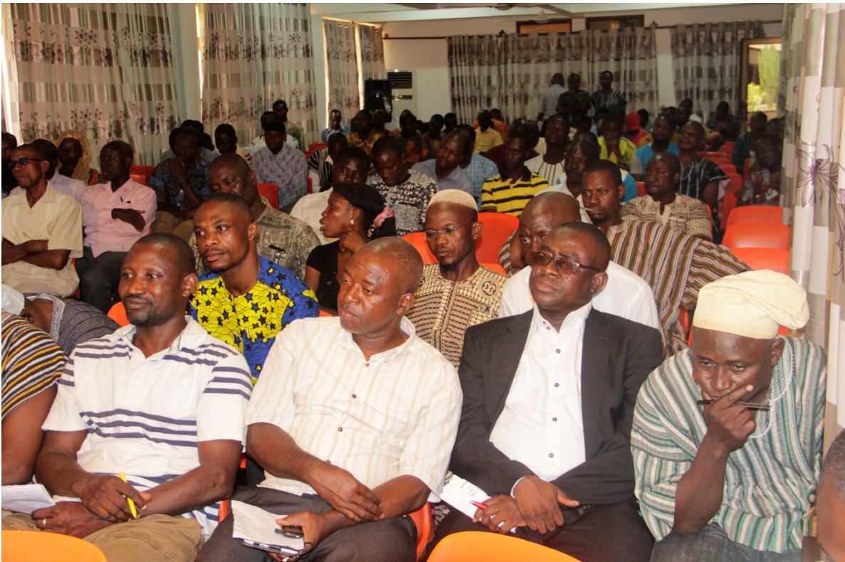
Above Photo: Sensitization workshop organized by MoRRD held 7 th March, 2018 at Radach Lodge and Conference Centre, Tamale