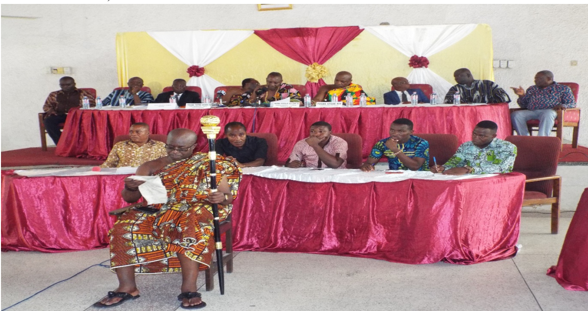
Justice Brobbey Commission consultation with Volta Regional House of Chiefs held on 15 th January, 2018 in Ho