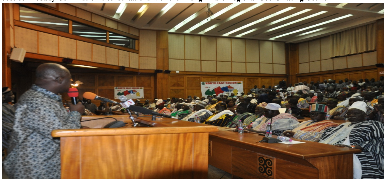
Hon. Daniel Botwe, welcoming the Overlord and people from the proposed North East Region at Accra International Conference Centre on 10 th April, 2018