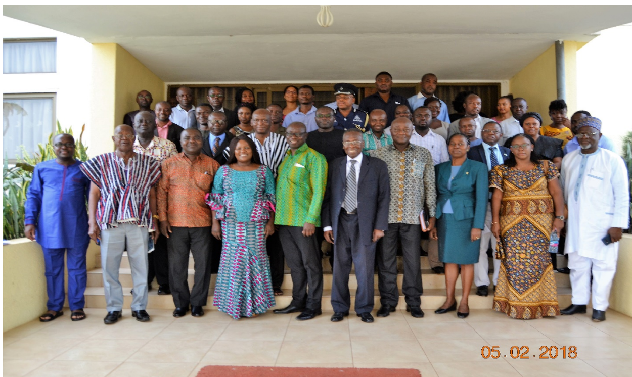
Justice Brobbey Commission's consultations with the Brong-Ahafo Regional Coordinating Council