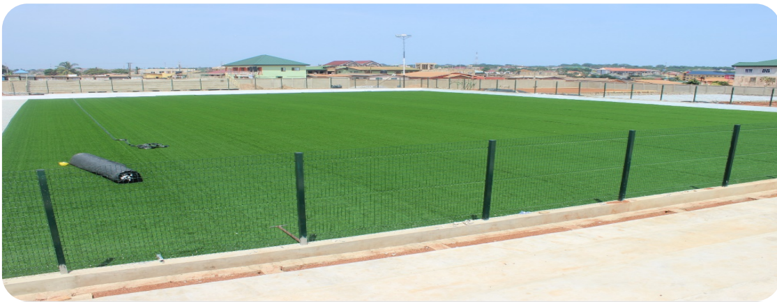
Astro Turf Madina, Accra