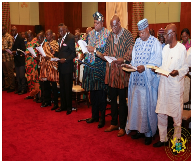
Inauguration of Zongo Development Fund Board