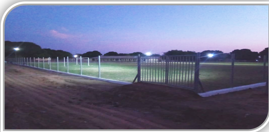
Green park, Yeji (B/A)