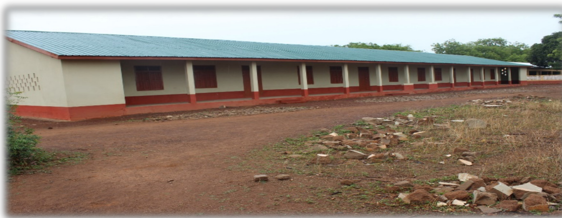
Renovation of DA/Primary School, Salaga (N/R)