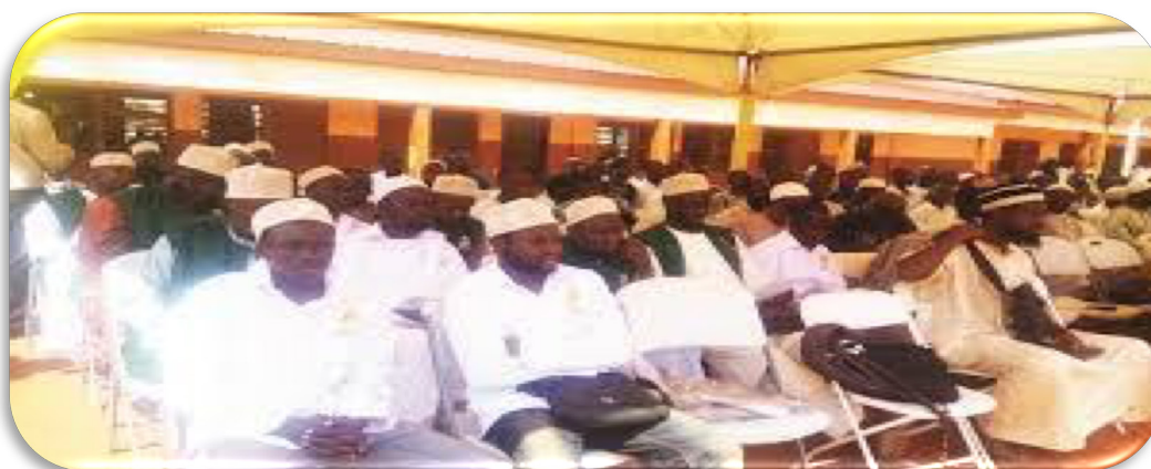
Recruitment, Arabic Instructors