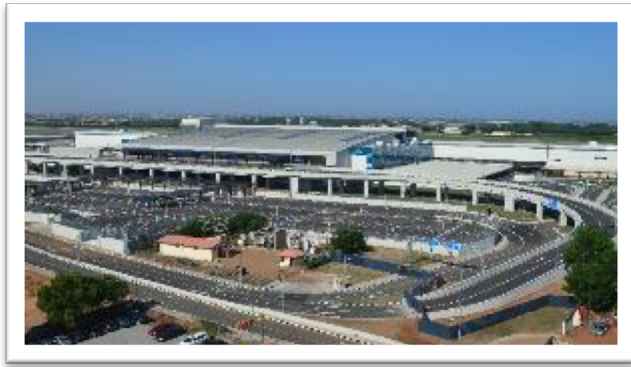
Arial view of the Terminal Building