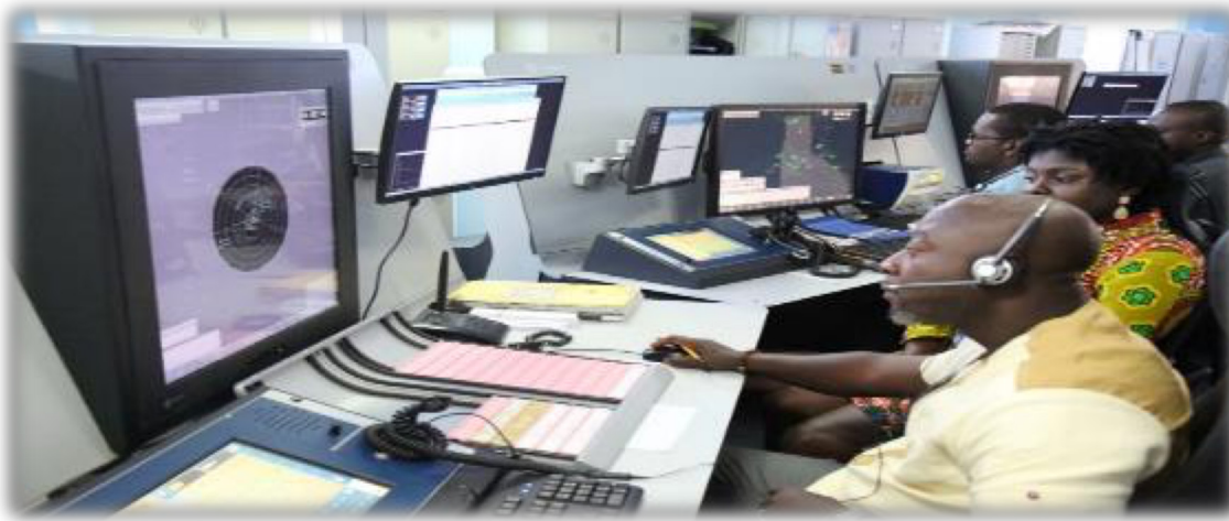
Air Traffic Management (ATM) System at KIA