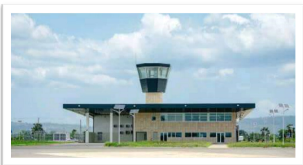
Newly constructed Terminal Building