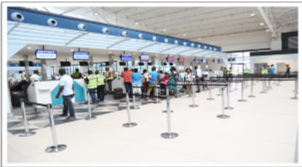
Checking Desks at Terminal Building