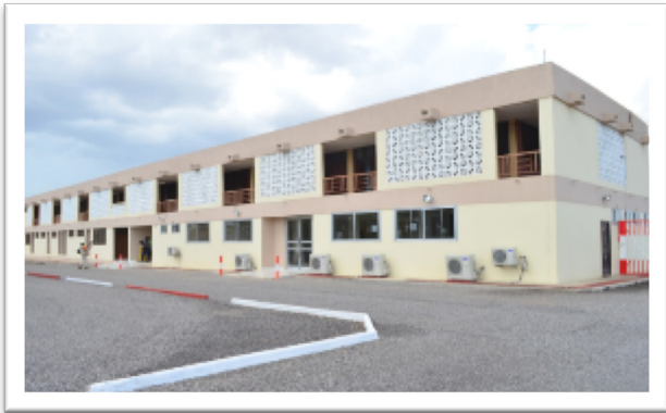
Rehabilitated new Terminal Building