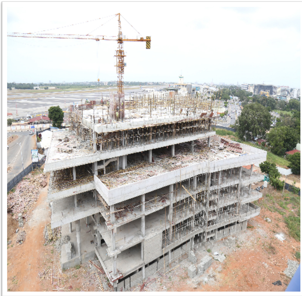
On-going construction of ANS Building at KIA