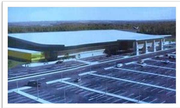
Artistic impression of Airport landside