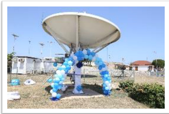
High Frequency (HF) Radios