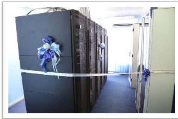
Very Small Aperture Terminal (VSAT)