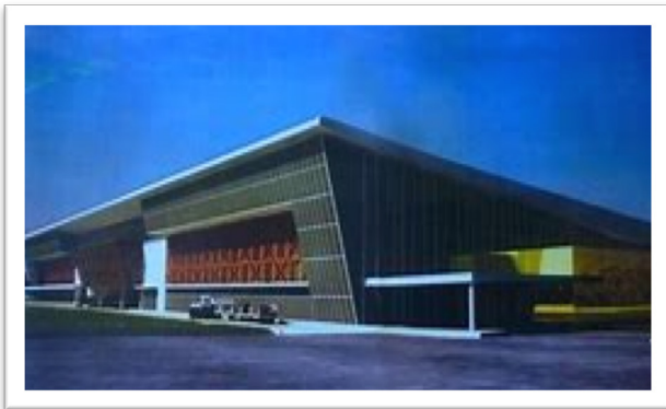
Artistic impression of Terminal Building (Airside)