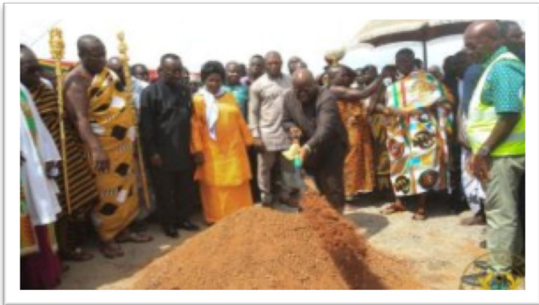
Sod Cutting Ceremony to commence work