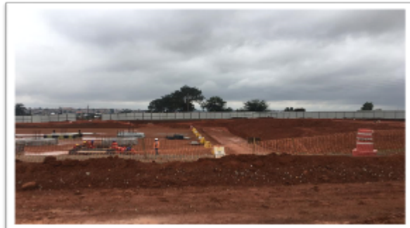
On-going construction of Terminal Building