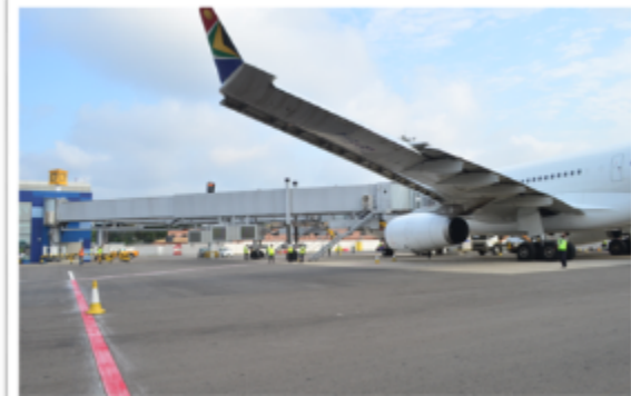
One of No. 6 Installed Aerobridge