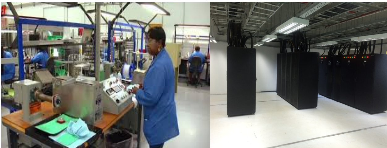
National Data Centre Infrastructure

NITA through the Ministry of Communications has signed a contract with Lebara Mobile Ghana Limited to lease the excess capacity (50%) of the network infrastructure for a period of five (5) years to enhance private sector operations. The agreement will generate revenue for the operations and maintenance of the network infrastructure to improve upon its business operations as well as that of MDAs and MMDAs.