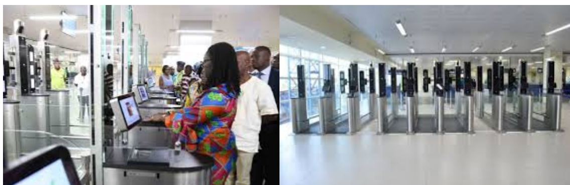
e-Gates system at the Kotoka International Airport

The integrated e-Immigration system being deployed by the Ghana Immigration Service will facilitate speedy processing of travellers entering and exiting Ghana, in a more efficient manner. It is expected to improve quality of service to the public. System Operational Acceptance has been achieved and Roll-Out of Secured Border Management System will continue till May 2019.