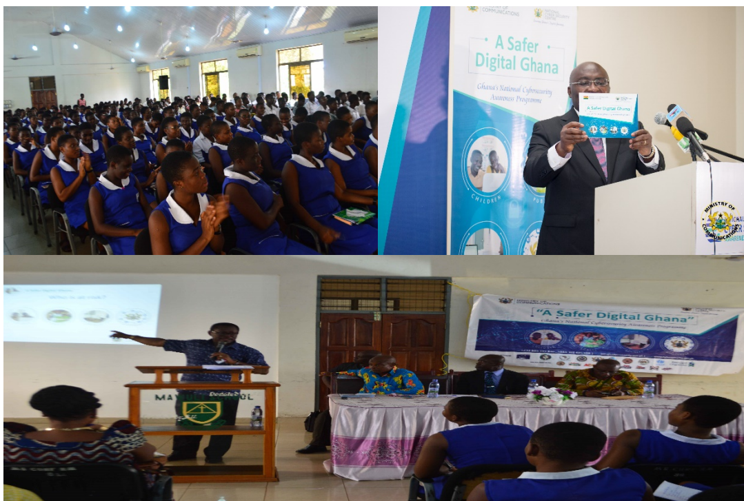
Picture of Vice President launching the National Cyber Security Awareness Week

The Ministry also partnered the Global Cyber Security Capacity Centre of the University of Oxford to conduct cyber security capacity maturity assessment for Ghana. This was to enable Government gain better understanding of Ghana's cyber security capacity with the aim to prioritise investment strategically in cyber security capacities.