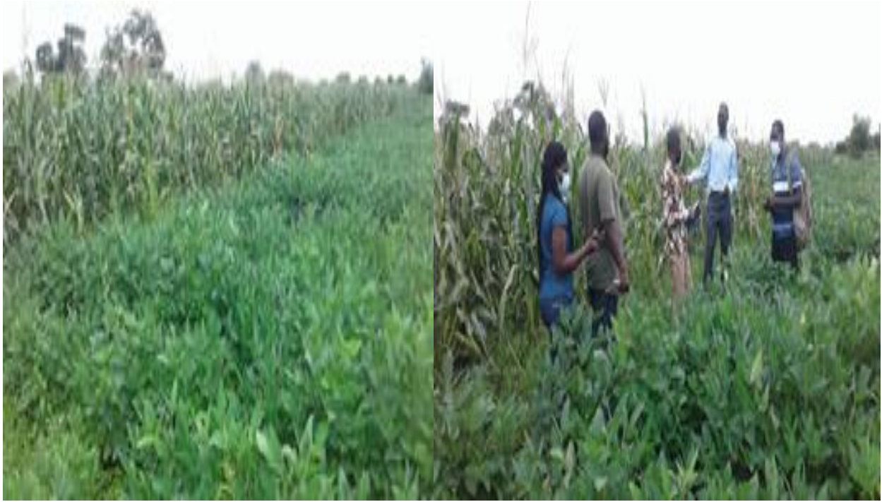
Maize Fields Intercropped with Cowpea