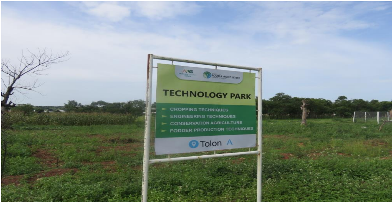
District Technology Park for Demonstrations and Adaptive on GAPs.