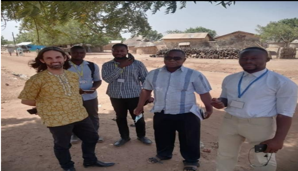
Team of officers from GiZ and Tolon District Assembly on ratable data collection for the DLREV Software