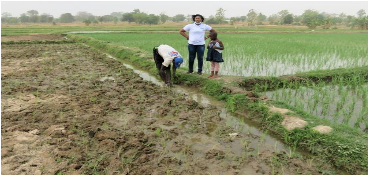
Dry season rice field at Goloinga