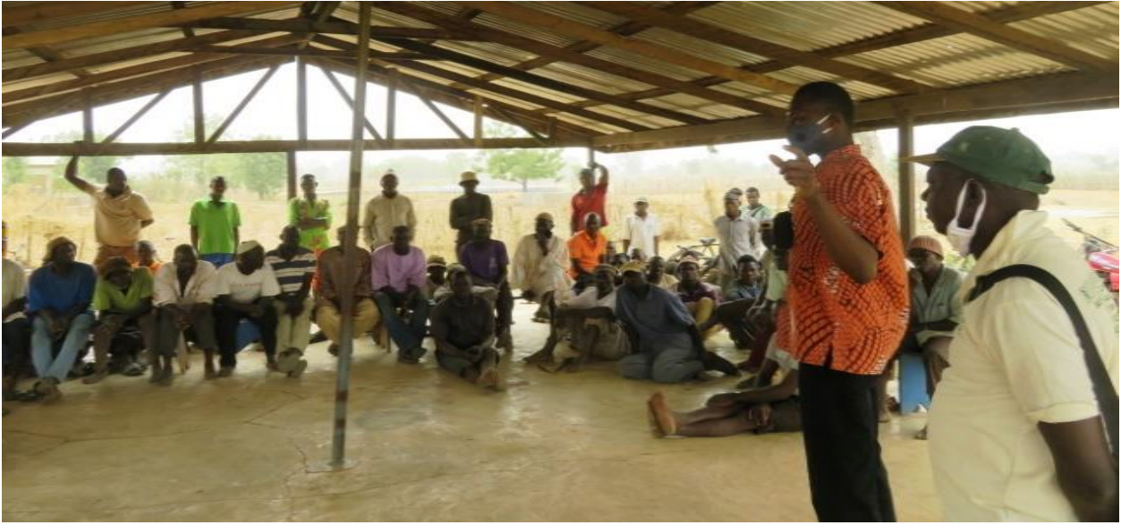
DDA meeting with Golinga dry season farmers