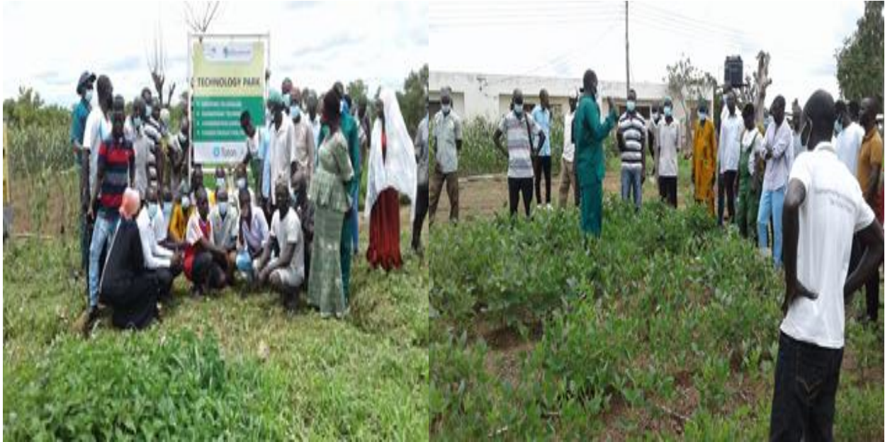
Field day at the Technology Park.

Crop officer taking farmers through the various stages of growth for both soybean and maize.