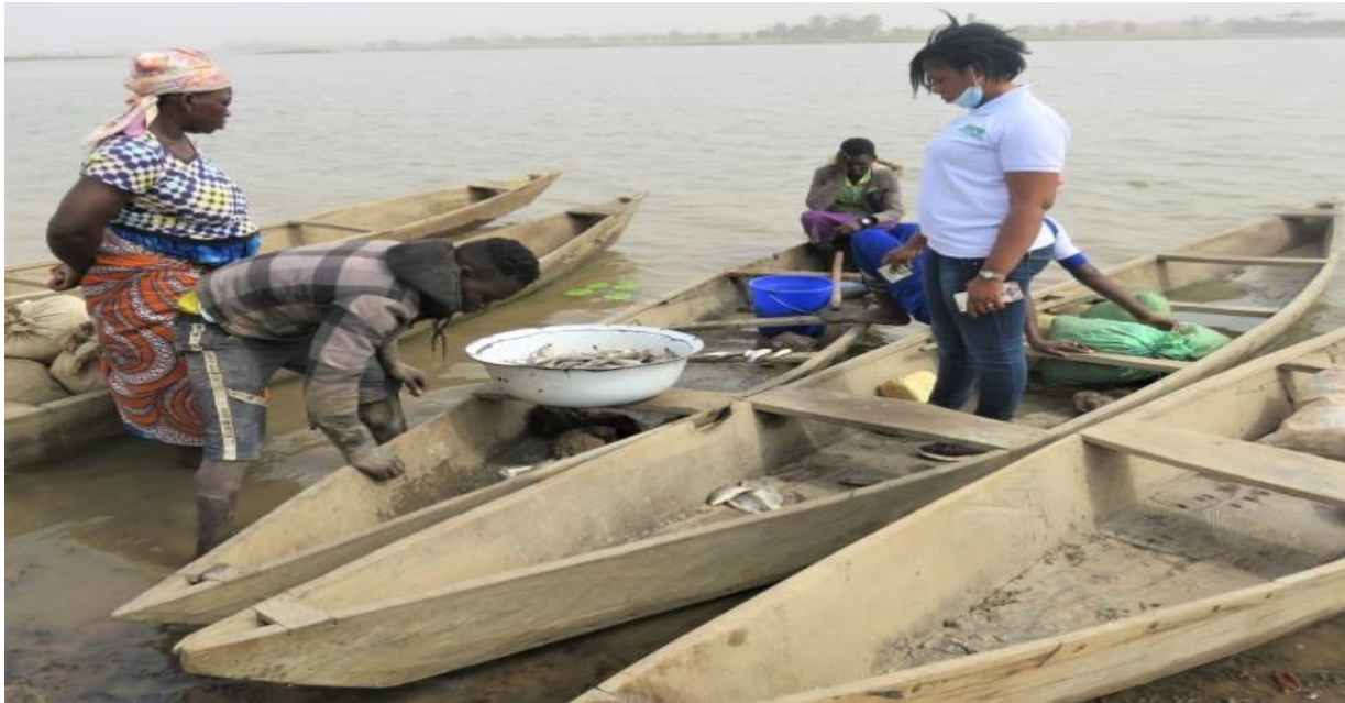
Other uses of Golinga Dam site: for fishing and domestic uses