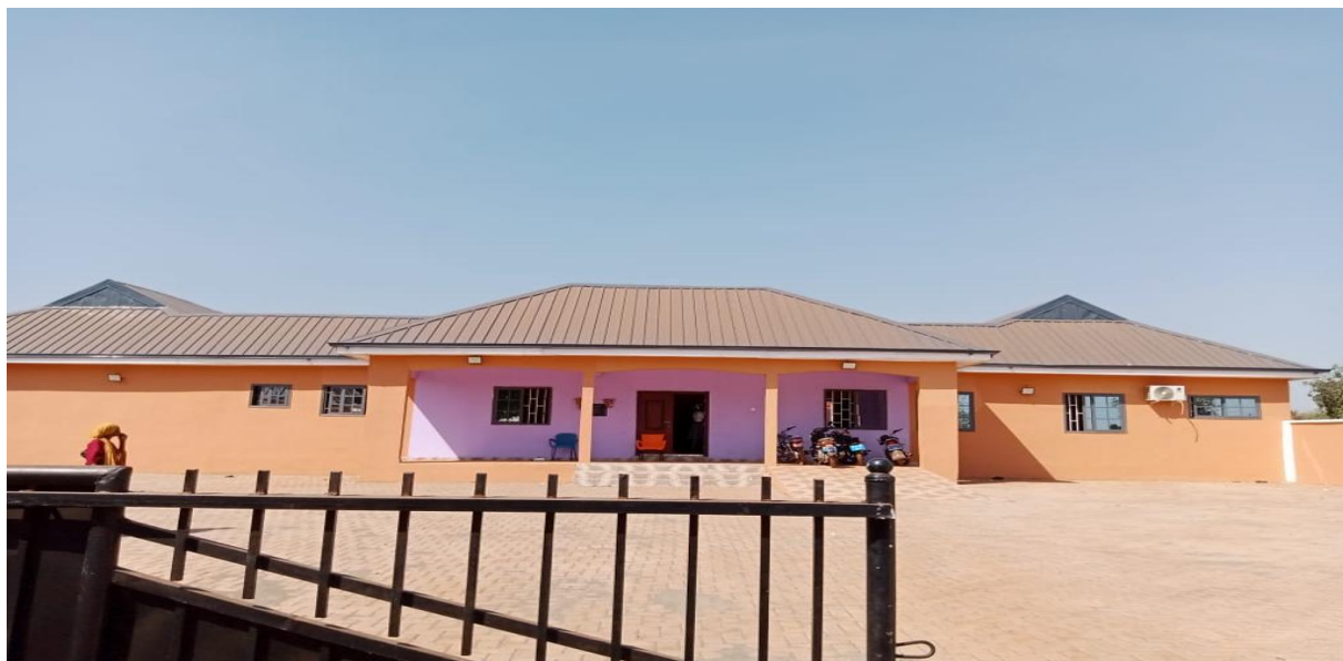
Community Centre at Tolon